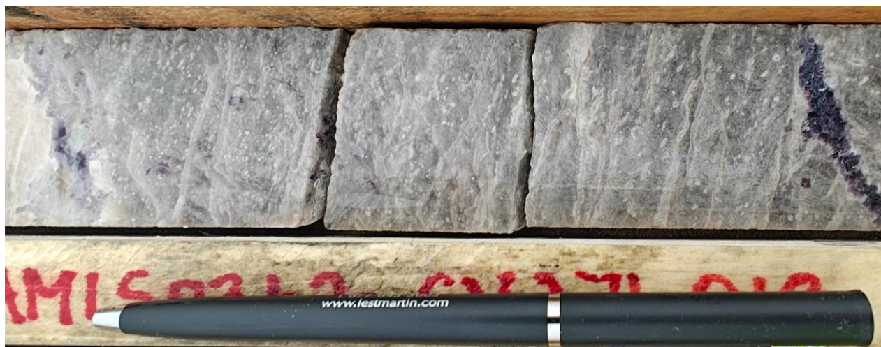
Figure 1: Pollucite mineralization in high-grade caesium drill intersection at ~64.5 m depth in drill hole CV23-271 at the Rigel Zone, CV13 Pegmatite. Interval grades 2 22.69% Cs 2 O over 1.0 m (64.0 m to 65.0 m) with XRD-Rietveld reporting a pollucite content over the interval of 58%.

Pollucite is considered the optimal mineral host to caesium in LCT pegmatites due to its very high caesium content (typically >30%) and its relative ease of processing and recovery. Pollucite is typically recovered using standard and conventional ore sorting methods as well as potential secondary flotation. The Company has completed collection of drill core samples from the Vega Zone for an ore sorting test program that will evaluate pollucite (caesium) concentrate recovery ahead of the typical spodumene (lithium) and tantalite (tantalum) recovery circuits.