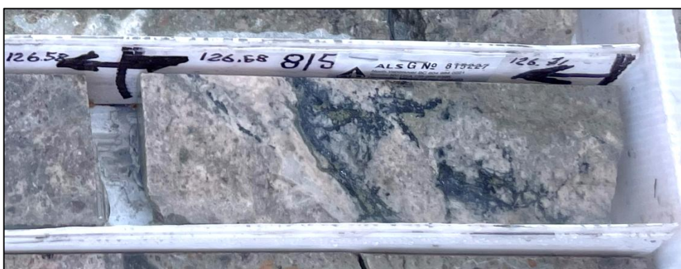
Figure 1. Cut portion of diamond core from YQ-25-001 at ~126.6 metres down hole. The interval forms part of the lower Pertenencia Vein intersection and comprises a breccia infilled by silver-bearing sulphide mineralisation (black), grading 0.13m at 2,250g/t Ag & 17.2g/t Au (3,569g/t AuEq) 1 .