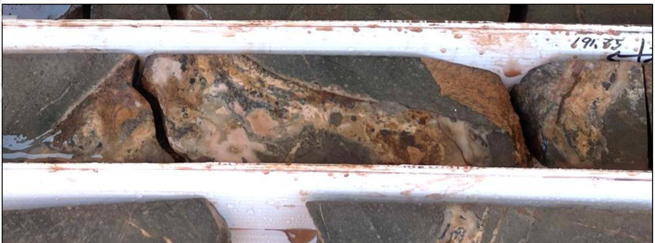
Figure 4. Cut portion of diamond core from YQ-25-001 at ~191 metres down hole. The interval comprises irregular quartz-feldspar-hematite-sulphide veins in an andesite host, with this interval grading 0.9m at 290g/t Ag & 1.47g/t Au (403g/t AgEq) .