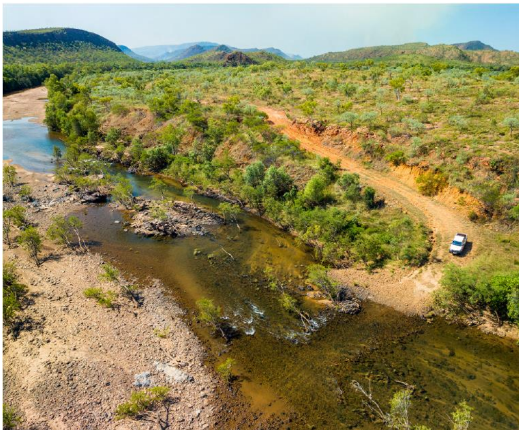
Figure 1: Photo of the existing historical Speewah access tracks at the Dunham River crossing

Access to the Project is currently via 47km of historical single lane natural terrain tracks from Doon Doon, a small community and roadhouse situated adjacent to the Great Northern Highway. Tivan, via its wholly owned subsidiary Speewah Mining Pty Ltd (“SMPL”), holds three granted Miscellaneous Licences which cover the majority of these existing access tracks, and has an agreement in place with Glen Hill Pastoral Aboriginal Corporation (GHPAC) to access parts which are not included (see ASX announcement of 31 May 2024).