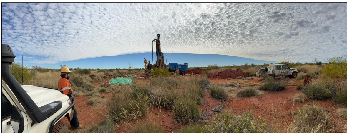
Photo 1 – RC resource definition drilling is advancing at Green, as aircore drilling of new targets gets underway

Our systematic regional aircore drilling campaign has the potential to replicate, or exceed, last year's success. In parallel, our infill RC program aims to define the high-grade zones within our existing resource base. With two rigs turning and multiple targets in play, we're entering one of the most exciting exploration phases in the project's history."