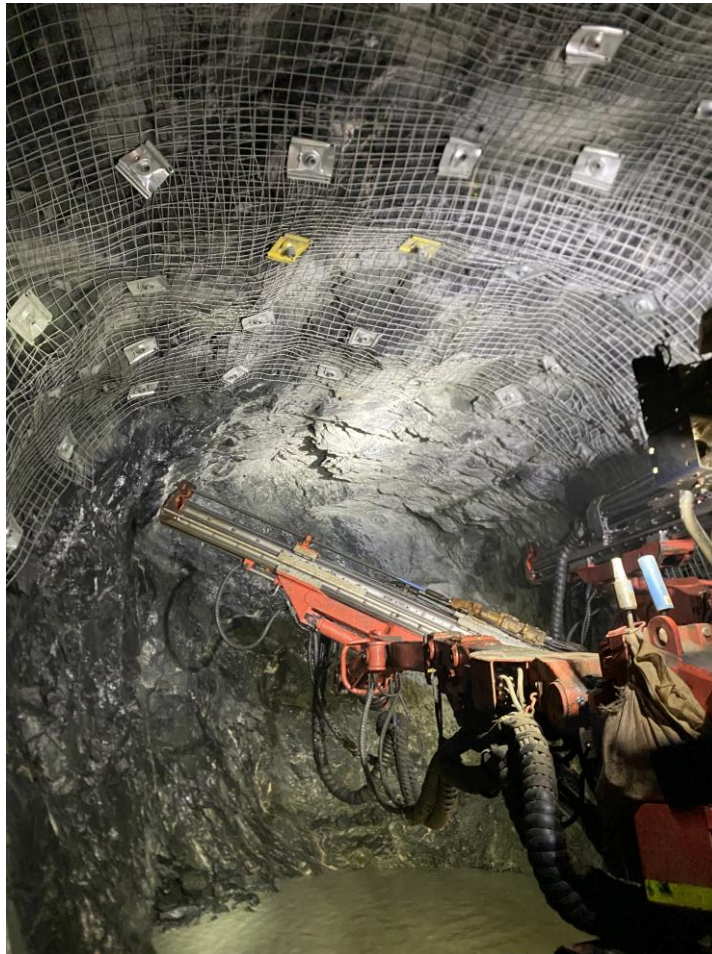
Figure 3 - Twin boom jumbo boring prior to firing the next Decline development cut