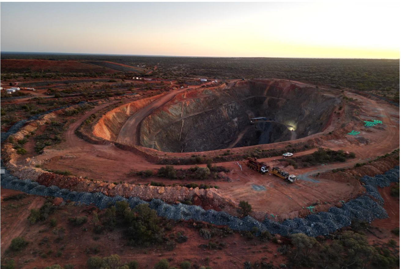
Figure 1 – RC drill rig set up, with the mining night shift crew heading underground

Fish becomes Brightstar's second active underground operation in Laverton and forms a key production step towards our larger development and production strategy. We look forward to updating shareholders as the Fish mine moves towards first gold and outlining Brightstar's larger development plans with the imminent release of the Menzies and Laverton definitive feasibility study."