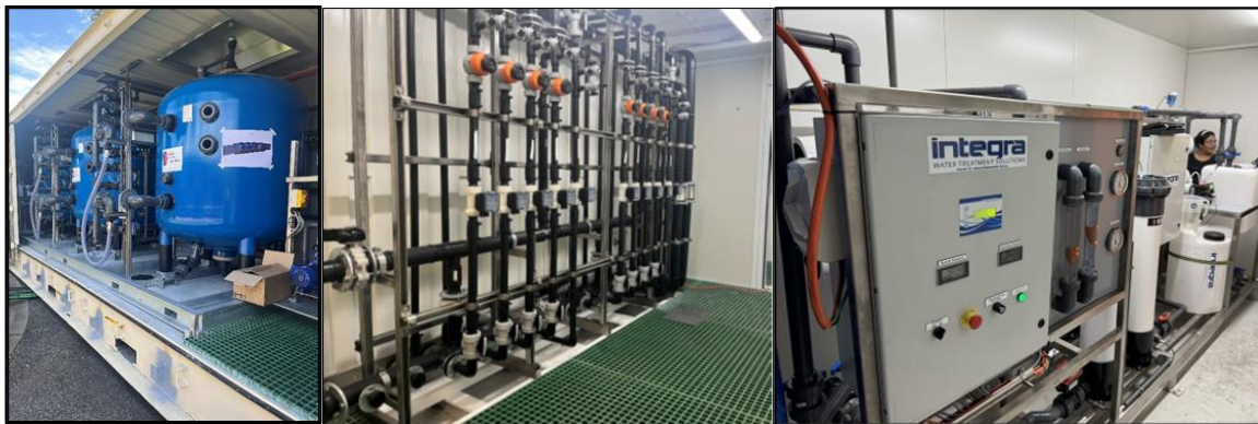
Fig 2 – Ion exchange module; Wellhouse (pipe room) module; Reverse Osmosis plant – all currently situated in Alligators Whyalla yard

This announcement was authorised for release by the CEO and Managing Director.