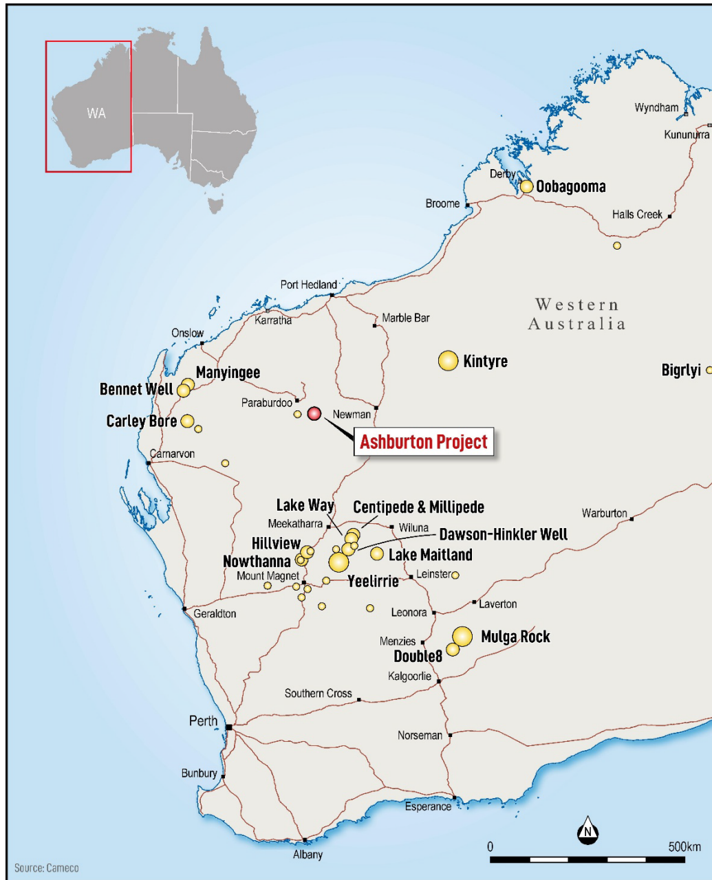
Figure 2: Uranium resources in Western Australia.

Western Australia remains underexplored for uranium, yet highly prospective, offering substantial opportunities for new discoveries across diverse geological settings. Uranium mineralisation is widespread across the state, occurring in terrains ranging from the Proterozoic Halls Creek Orogen and Palaeozoic Canning Basin in the Kimberley, to the Palaeozoic Southern Carnarvon Basin, and within Cainozoic palaeodrainage systems overlying the northern Yilgarn Craton (see Figure 2).