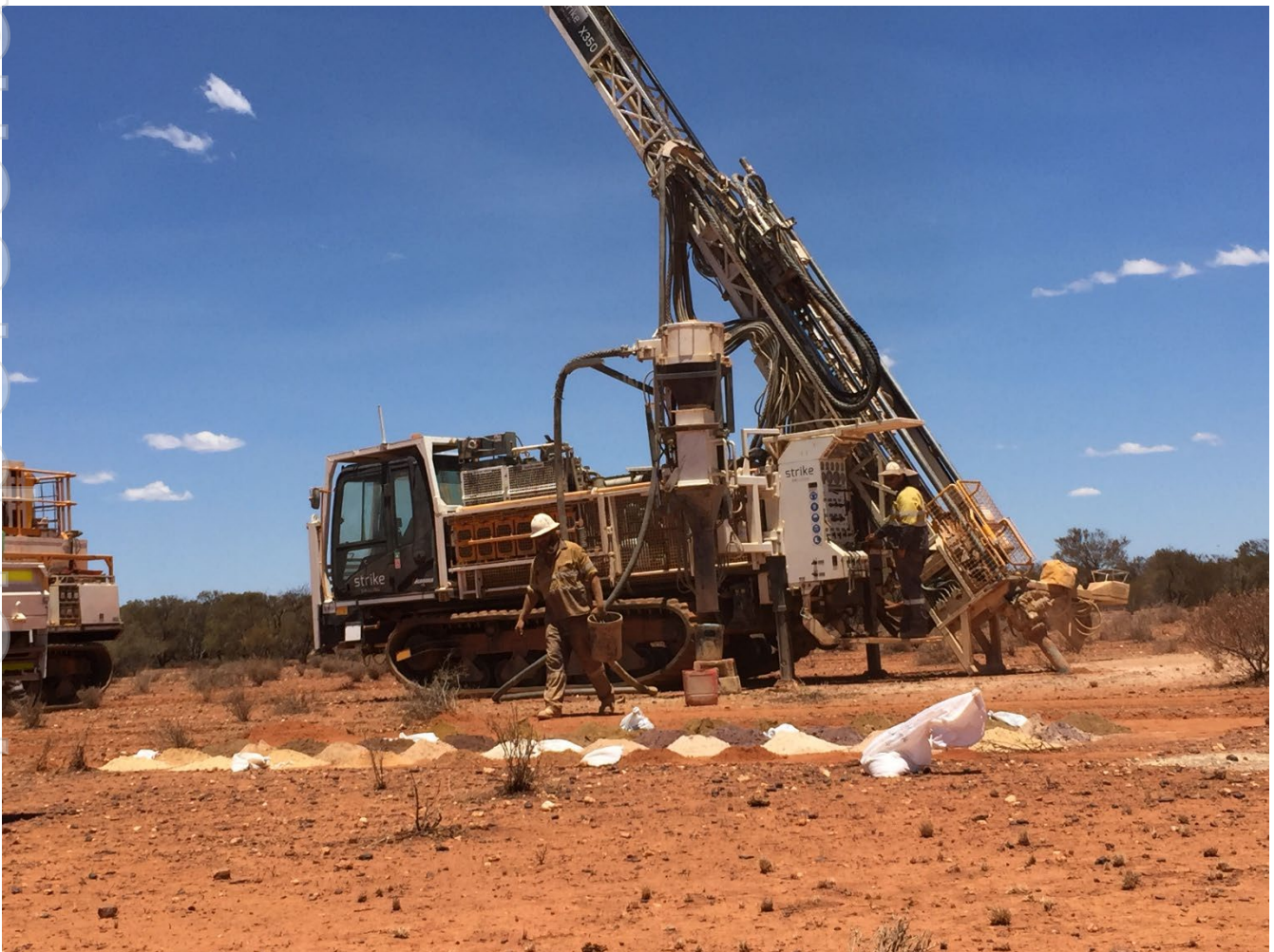
Photo: Multi-purpose Air-core and Reverse Circulation Rig at Yundamindra

“With an initial 10,000m of drilling planned, we expect this program to be the start of a comprehensive drilling campaign to continue throughout the remainder of the year at Yundamindra and Kookynie, ensuring plenty of news flow for shareholders over the second half of the year.”