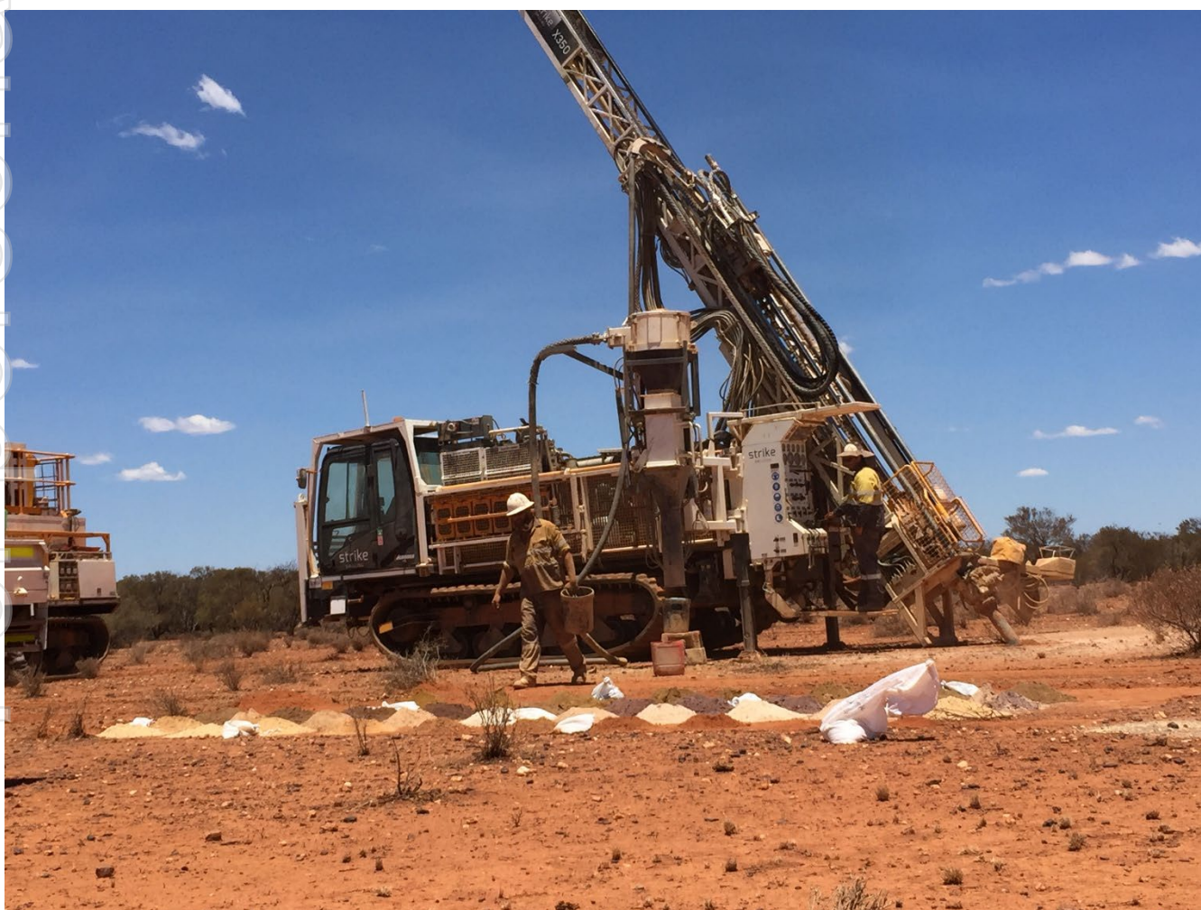
Photo: Multi-purpose Air-core and Reverse Circulation Rig at Yundamindra

“With an initial 10,000m of drilling planned, we expect this program to be the start of a comprehensive drilling campaign to continue throughout the remainder of the year at Yundamindra and Kookynie, ensuring plenty of news flow for shareholders over the second half of the year.”