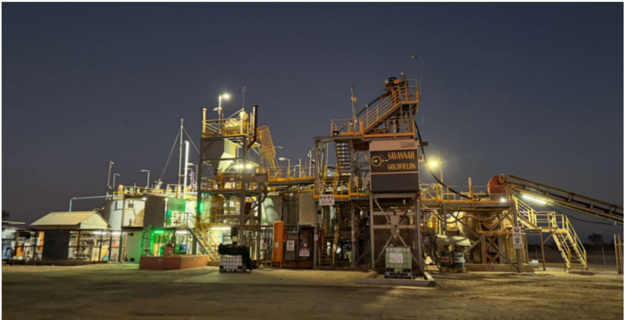
Figure 2 Georgetown Gold Processing Plant June 2025

The Georgetown gold processing plant continues under care and maintenance and remains in good overall condition (Figure 2).