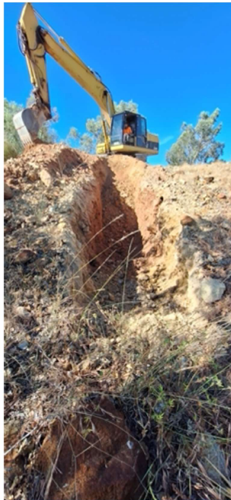
Figure 3: Sample trench at historically rehabilitated feature in the Georgetown area

The preparation of this series of applications to update Environmental Authorities remains on track to be submitted progressively over the next three months.