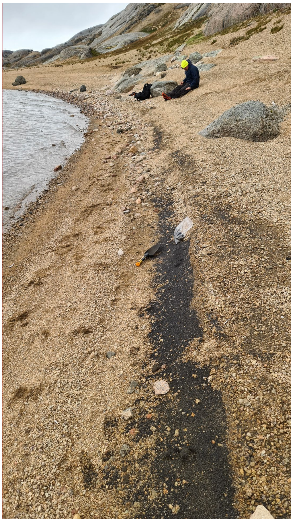
Figure 5: Grab sampling of the coarse crystal rich alluvials.