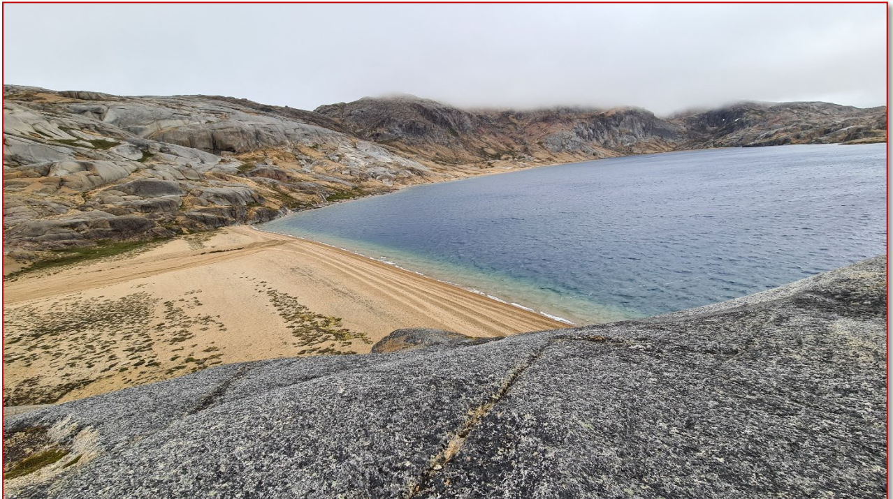
Figure 4: Coarse crystal rich 'beach' at Blue Lake.