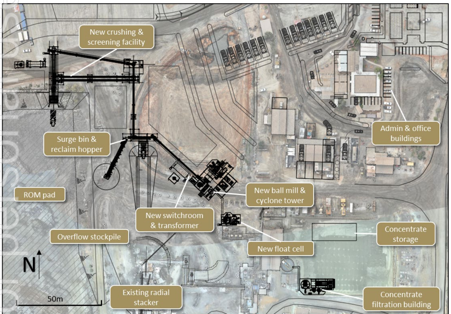
Figure 1. Plan showing layout of expanded Eloise processing plant

The expansion has been designed to minimise impact on current Eloise operations during construction (see Figure 1).