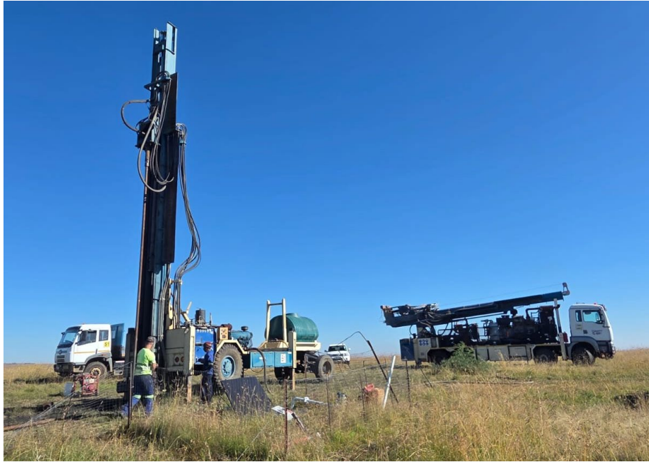
Workover Rig on Location