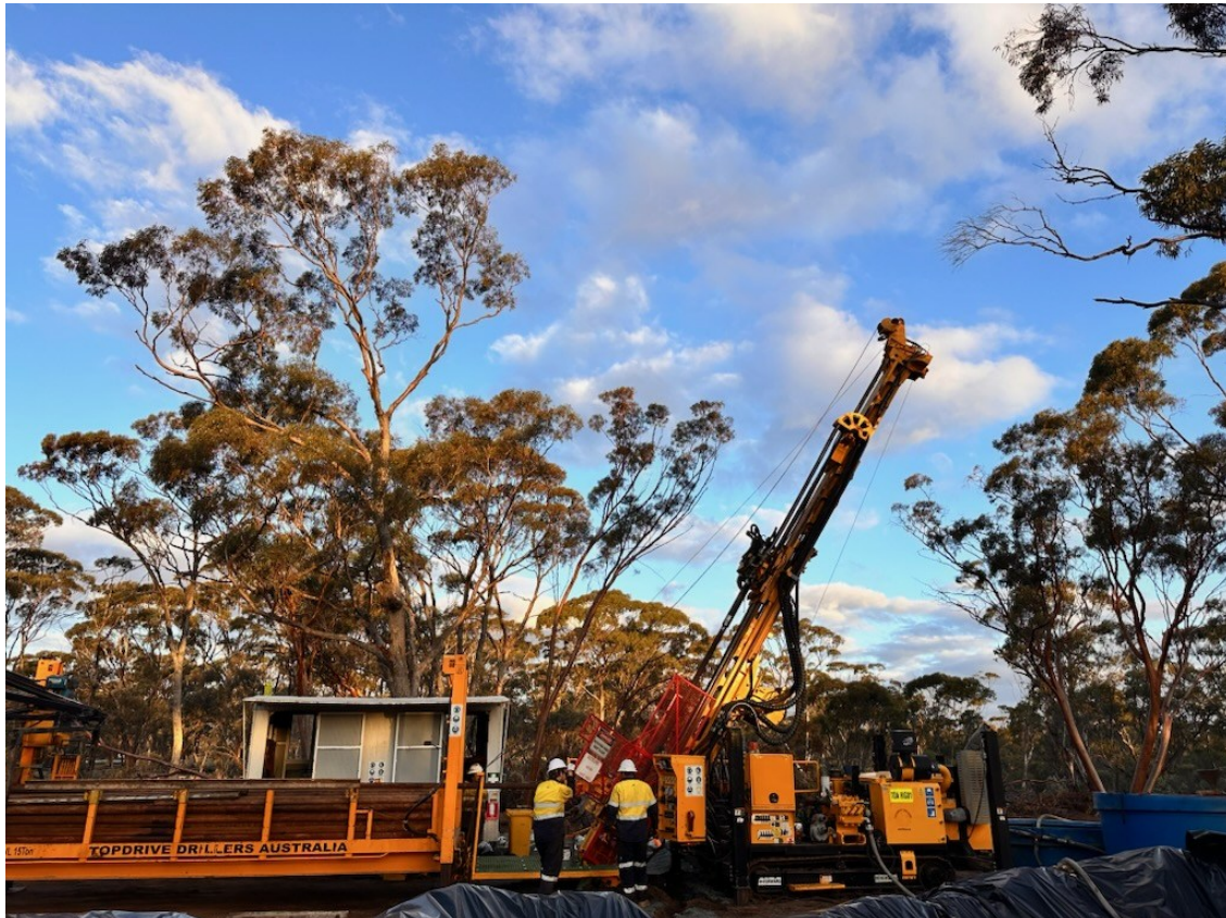
Figure 1: Commencement of Diamond Drilling at Hopes Hill project.