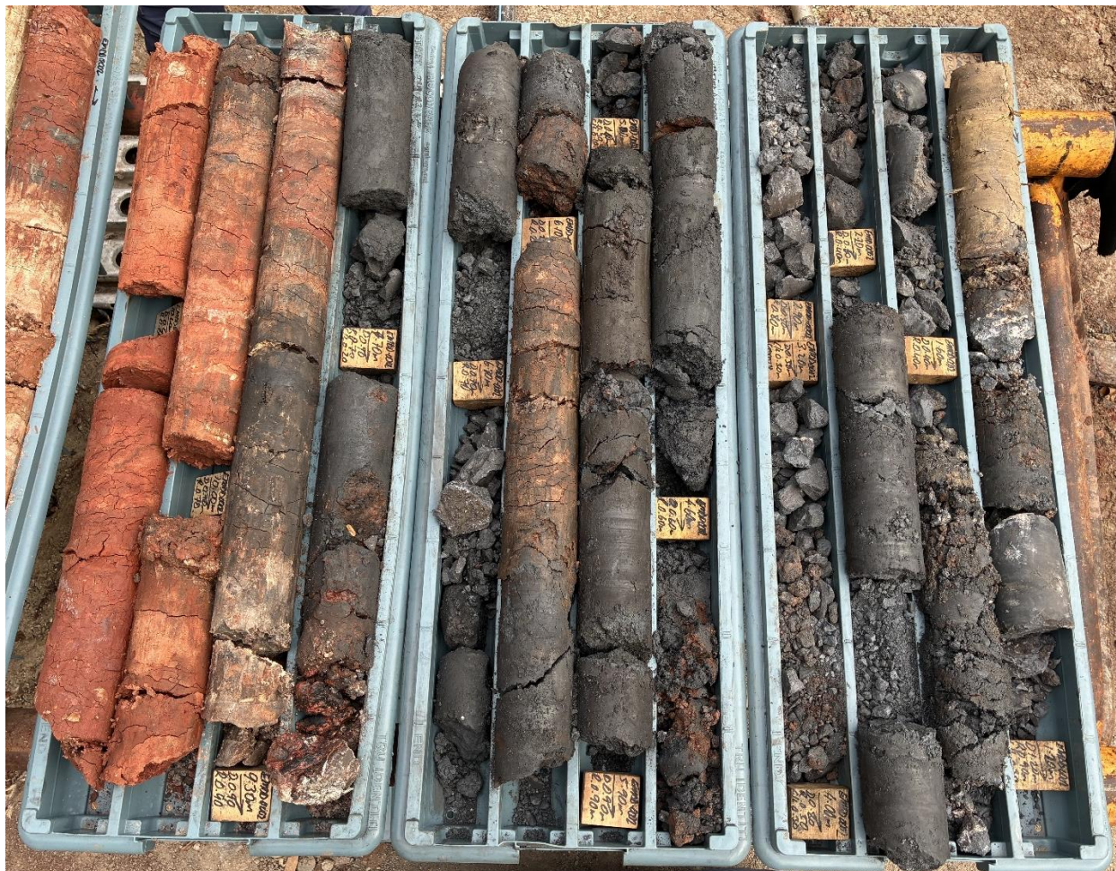
Figure 2: Tray 1 (right) to tray 3 (left) of EMDD002 showing the full intersection of PQ core with visual estimates presented in Table 1

I look forward to updating shareholders with further exploration updates. Go Estrella!"