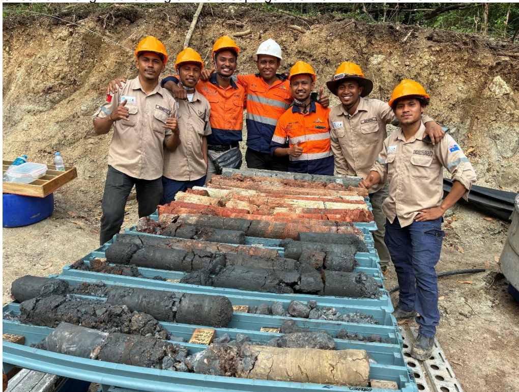
Figure 3: Pictured above are the in-country geologists who made the Ira Miri discovery during a return trip to the area.

For comparison, the mineralisation at Groote Eylandt Manganese Deposit 3 located in the Gulf of Carpentaria ranges from 0.1m to 11.5m thickness, and averages 3m in width. Although the age of the mineralisation of Groote Eylandt is the same as at Ira Miri, the method of formation of manganese at Ira Miri is terrestrial in origin consisting of in-situ supergene enrichment of the Noni Formation.