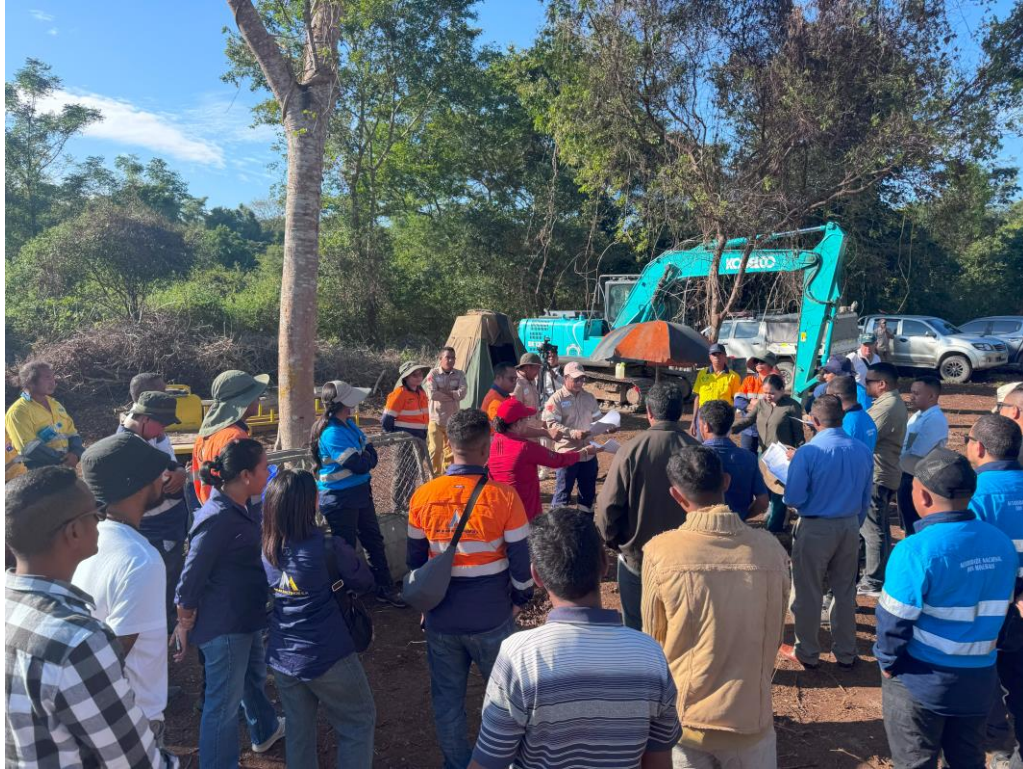
Figure 5: Over 50 investors and dignitaries during site induction at the Ira Miri Manganese Project, Timor-Leste

The large contingent was shown around site by the Estrella team and were able to witness the drilling of EMDD002, the trench dug into massive manganese oxides near the drill site and the new outcropping discovery of massive manganese oxides located some 350m to the north northwest of drilling.