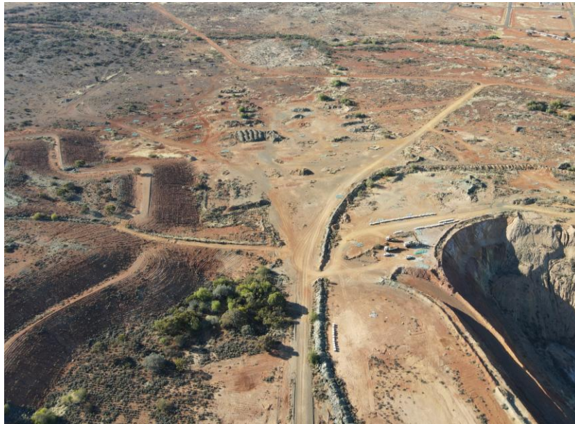
Figure 2 - Existing Lady Shenton Open Pit (foreground) and the unmined, drilled out Pericles Deposit (looking north-west)