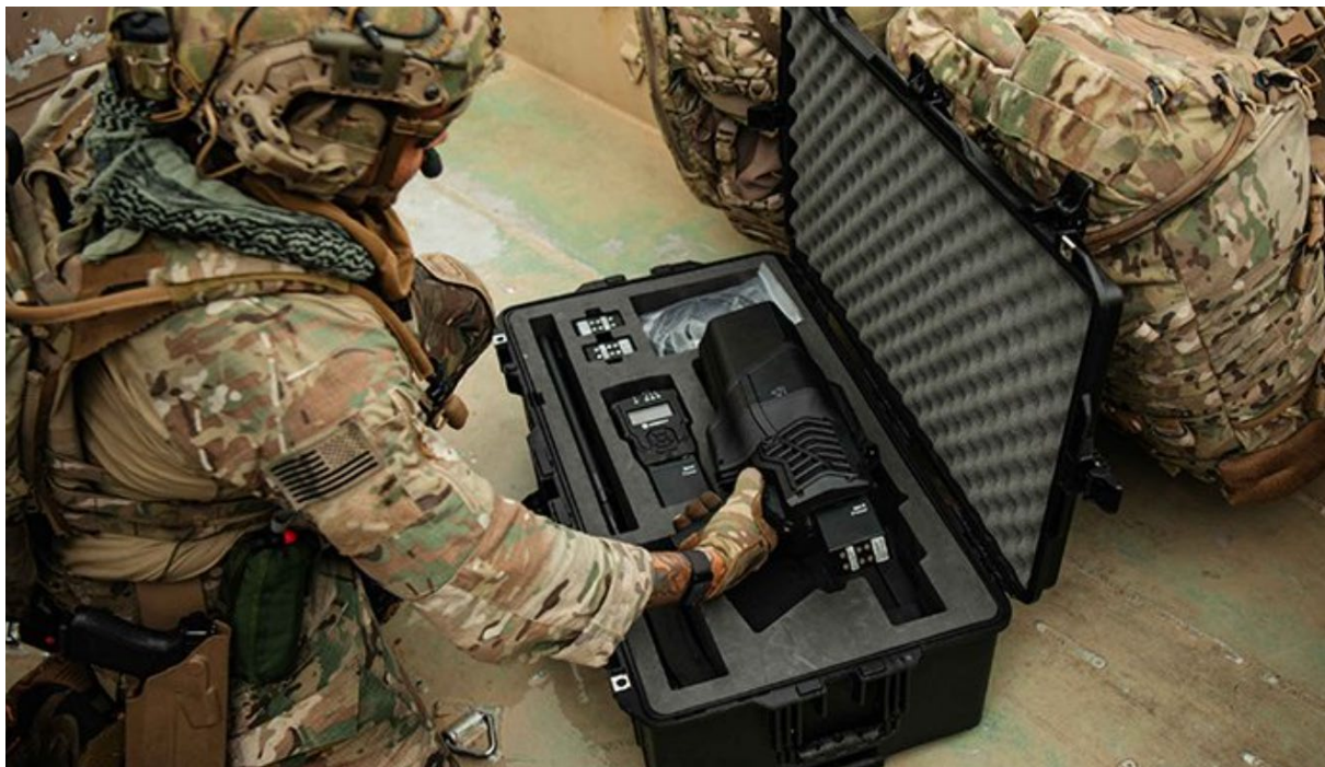
Image: DroneShield Immediate Response Kit

Over the past 24 months, DroneShield's reseller involved in this package of contracts has progressively increased DroneShield orders from single evaluation units to multi-million dollar contracts, with all imports, deliveries, and payments handled on-time and in a highly professional manner. DroneShield had previously received a single contract from this reseller for this specific customer in April 2024 totalling approximately $0.5 million. There is no obligation for any additional contracts from this reseller or the customer.