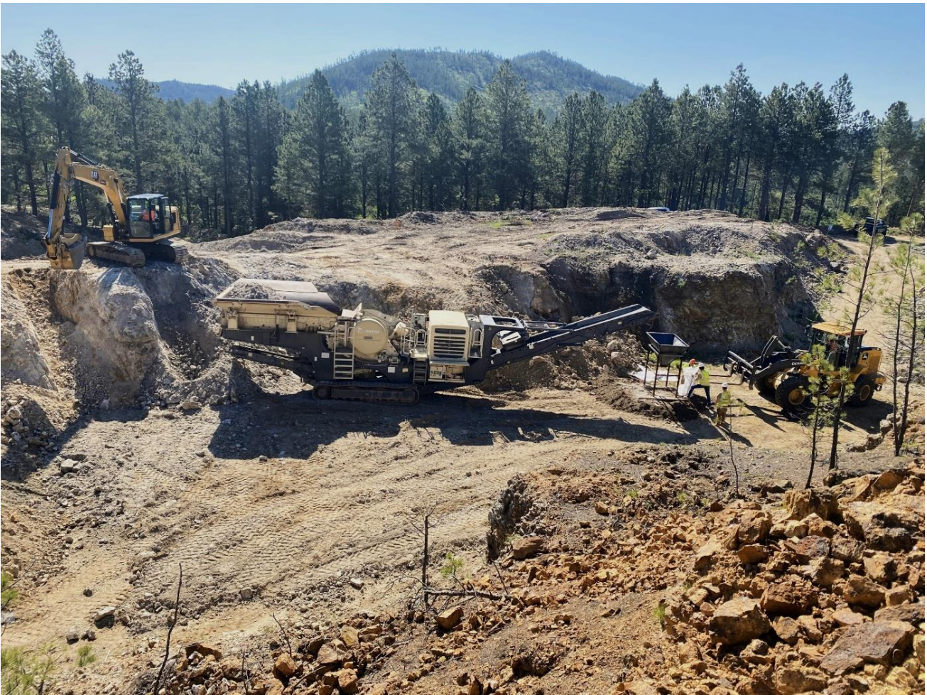
Figure 1: Mining and crushing operations at the Beecher Project

Figure 1 shows the layout and operation of the mining and crushing equipment within the Longview Pit at the Beecher Project during collection and packaging of the bulk sample.