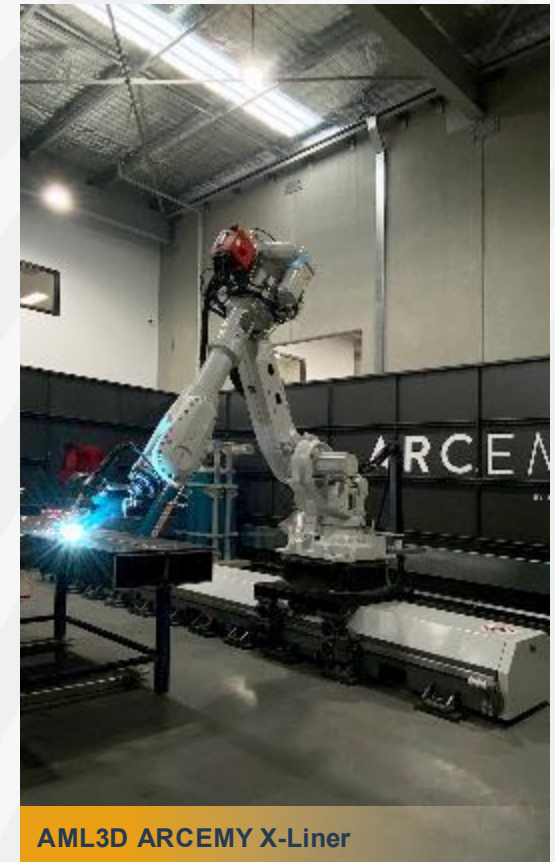
AML3D ARCEMY X-Liner