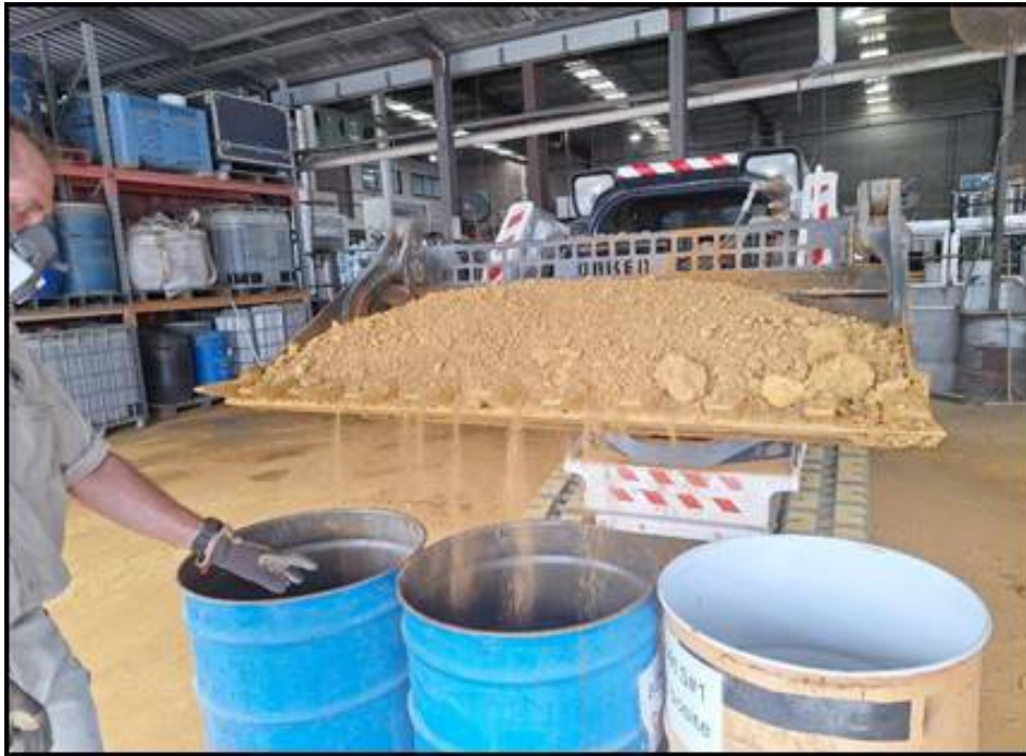
Figure 2: Bulk sample being prepared for Bulk Leach test at BML