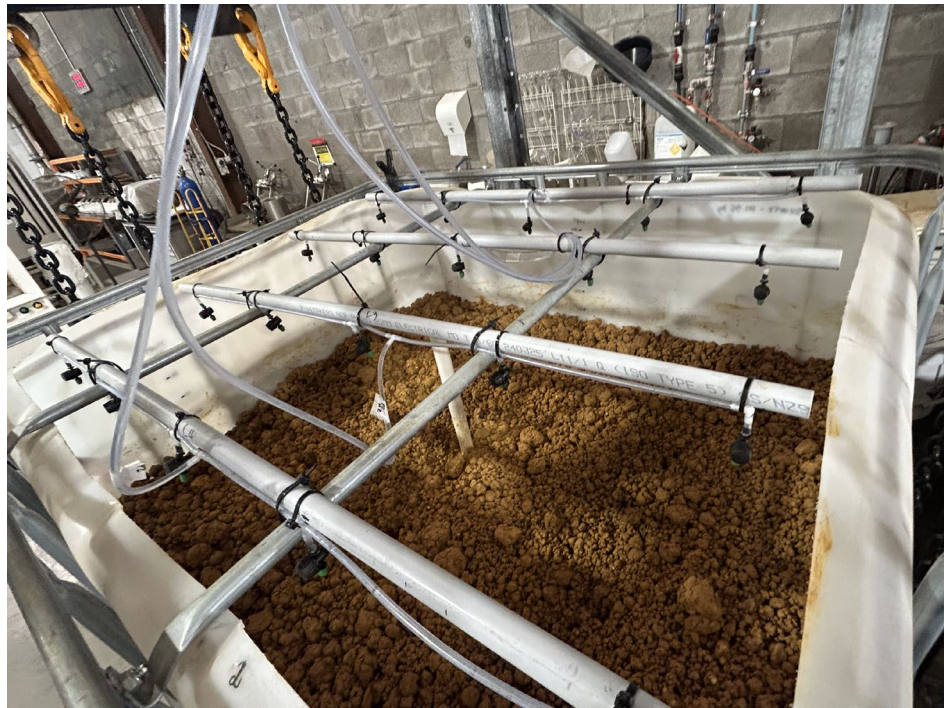
Figure 3: Bulk Leach with dripper system applying lixiviant for leaching

The results validate AR3's confidence in using cost-effective, small-scale laboratory tests to optimise the heap leaching process. The bulk test also significantly de-risk scaleup to full production, reinforcing the viability of AR3's innovative, low-cost method. The findings provide a strong foundation for the ongoing Pre-Feasibility Study (PFS), positioning AR3 for success in delivering sustainable rare earth production.