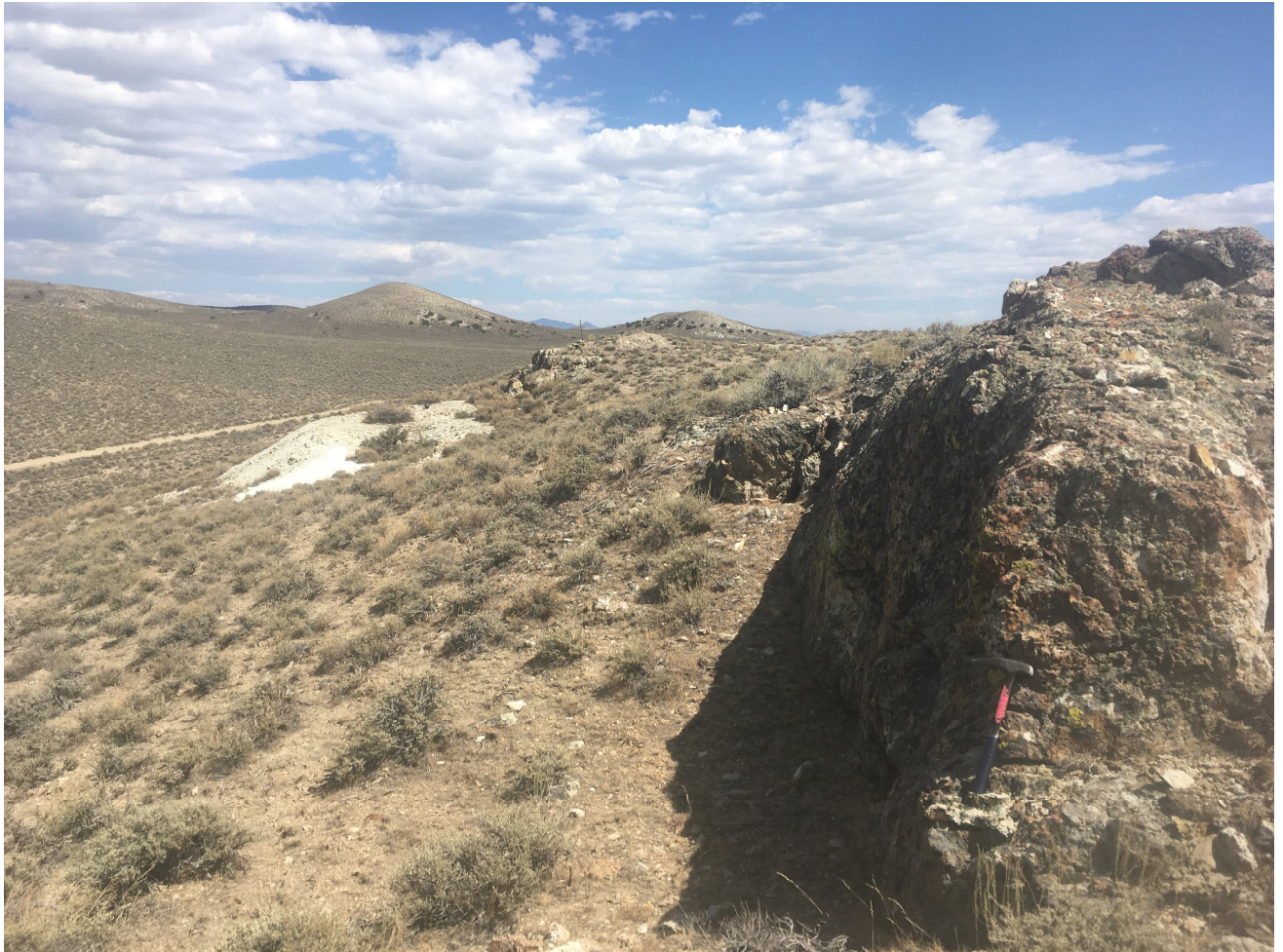
Figure 5. Large planar silicic vein in northern Broken Hills area with prospect pits