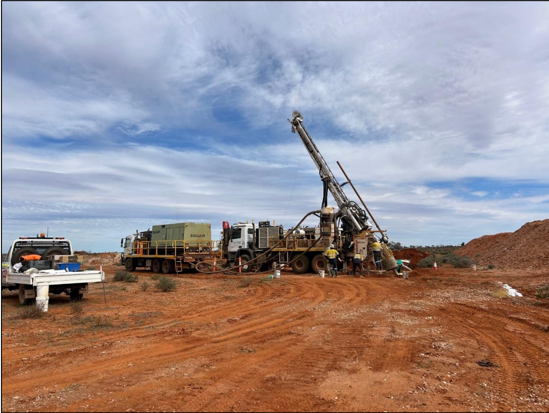
Figure 2: RC Drill Rig on Site at Killarney Project