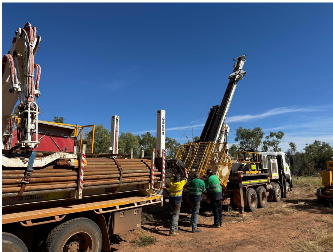
Figure 2 – The rig being set up at Grunter North.

At the time of writing, drilling has commenced with hole GN25-01 (planned EOH 450m). The main geophysical target area is expected to be intercepted in the coming days.