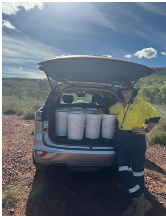
Figure 2: Grab samples collected from historical stockpiles at The Big One Project, Mt Isa Copper Belt.

Low residual copper concentrations (<1.2%) across most samples suggest minimal presence of resistate copper minerals (e.g., chalcopyrite or refractory cupric phases), further supporting efficient copper recovery using conventional processing pathways.