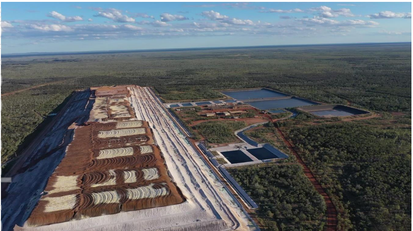
Figure 5: Aerial view of Austral's Mt Kelly processing facility.

This demonstrated compatibility materially reduces barriers to production and positions the Company to potentially capitalise on existing infrastructure, permitting channels and operational expertise. The ability to process legacy stockpile material as a potential starter operation enhances commercial flexibility while broader exploration and resource growth programs continue across the NWQ Copper Project.