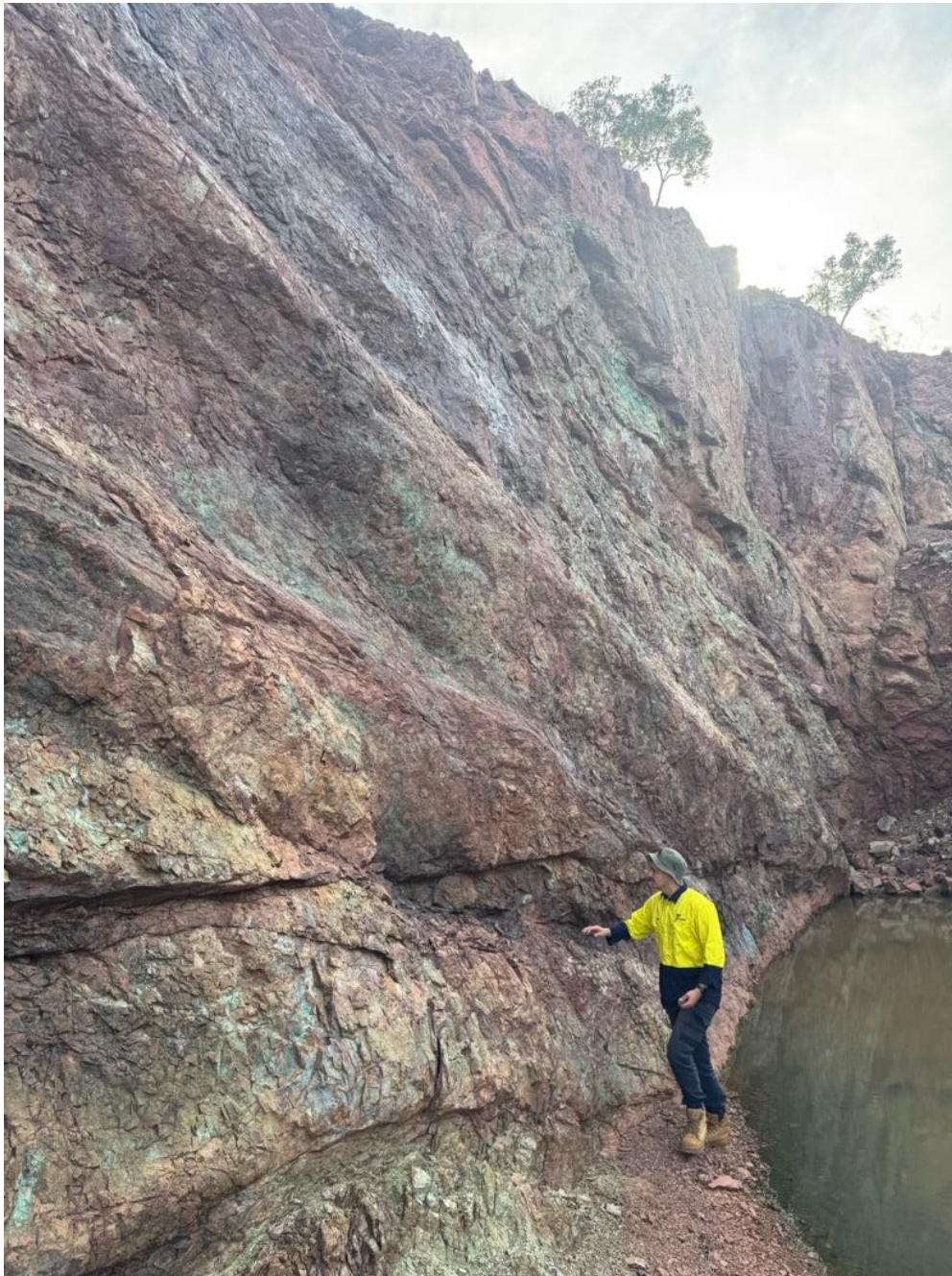
Figure 6: Jointing and shearing displayed along face of Pit 1 at the Big One Deposit.

The Big One Deposit is the most advanced prospect within NFM's significant 977km 2 NWQ Copper Project, which is located in a Tier 1 jurisdiction and surrounded by world-class infrastructure as well as mining operations of majors such as Anglo American, Glencore, and Rio Tinto. It has a JORC-compliant Mineral Resource Estimate (MRE) of 2.1 Mt at 1.1% Cu for 21,886 tonnes (see Appendix A) of contained copper metal.