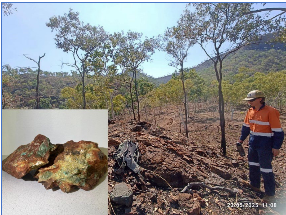
Figure 1. Outcrop sampling at Speewah Nth. Inset gossanous malachite sample with antimony.

This program was Tambourah's first exploration activity at Speewah Nth. The Company has confirmed local high grade antimony, copper and silver associated with an extensive vein system developed between the Catto and Chapmans prospects. Further work will be aimed at extending outcrop mapping and sampling over the eastern margin of the Speewah Dome in preparation for drilling.