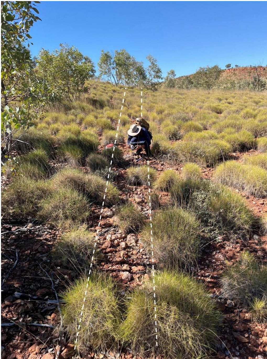
Figure 2. Newly discovered HRE bearing hematite quartz breccia vein with geologist Macgregor Vidler from Dingo Prospecting

Other areas on the tenement were also prospected, including Mt Mansbridge South (Figure 1), where a 0.5m silicified siltstone outcrop historically returned assays of 1552 ppm Yttrium 3 . The RareXploration team located the outcrop and, through further prospecting, identified a 70 m hematitic quartz vein bearing HREEs. The vein crops out intermittently along strike and ranges in width from 0.2 to 1 m.