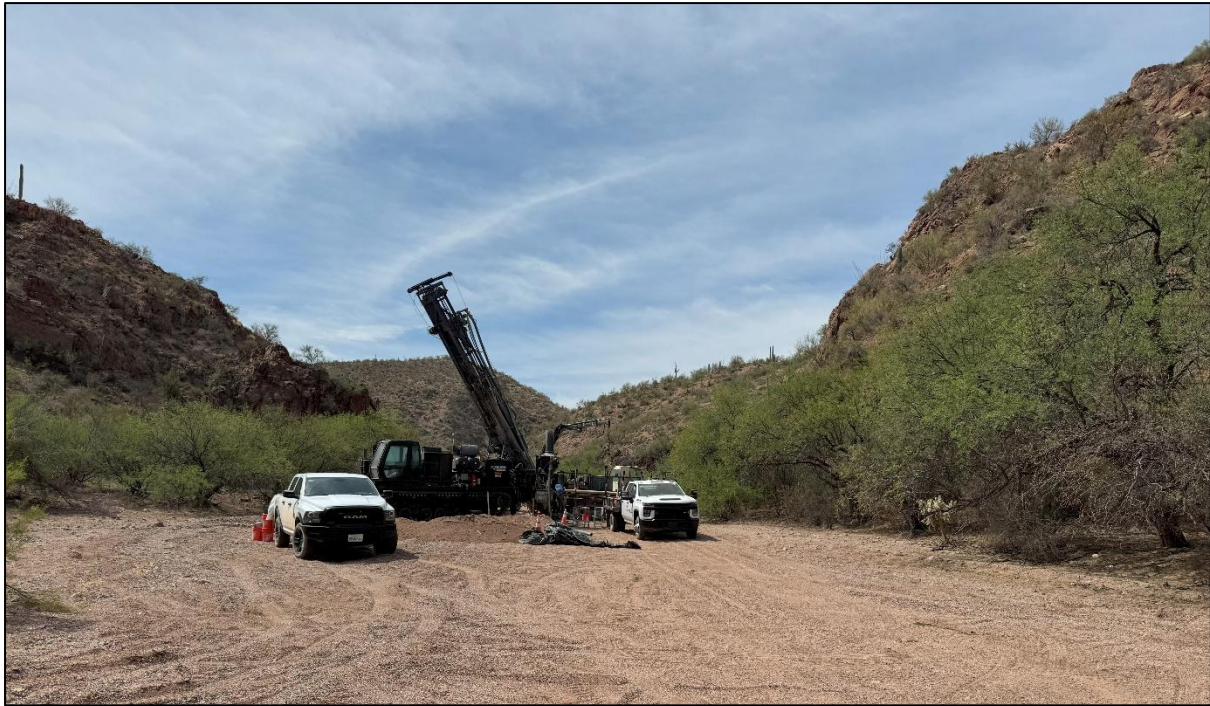
Figure 4: Ford Prospect - Drilling PRC009 targeting beneath the Ford Mine workings from the Tucson Wash.