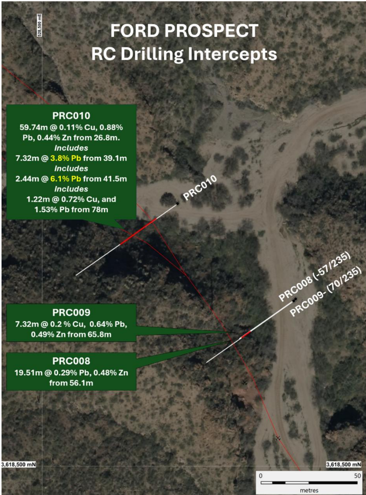
Figure 3: Ford Prospect, plan view with significant drilling intercepts.