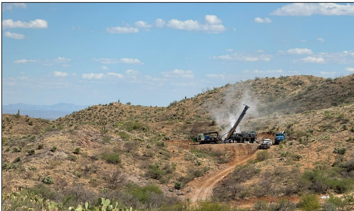
Figure 1: RC drilling at Odyssey Prospect (facing south)