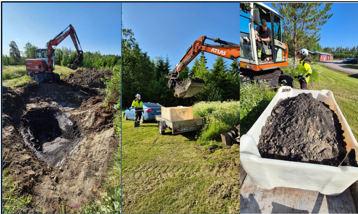
Figure 1: LnCS bulk sample collection in progress. Image does not purport to represent grade or mineral distribution.

The bulk sample from the LnCS is being used for the conduct of metallurgical test work programs in both Finland and Australia.