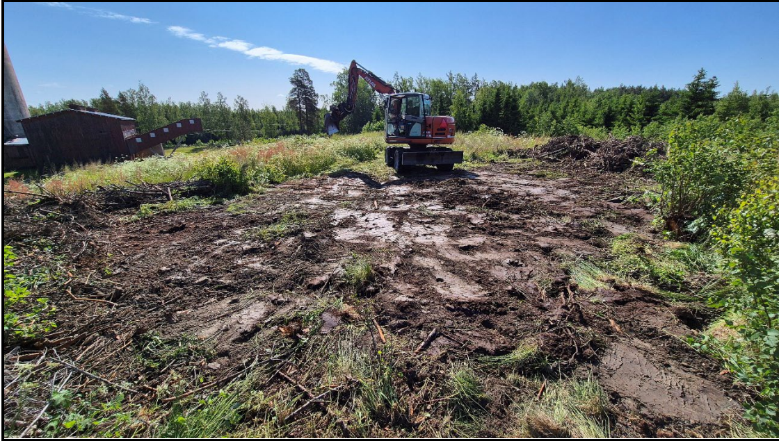
Figure 3: Bulk sample site fully rehabilitated with erosion control cover restored.