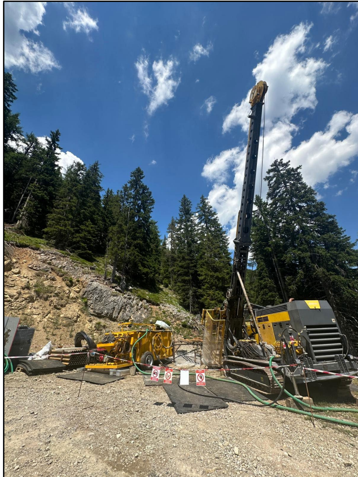
Figure 1: GEOPS Diamond Rig in position.

“I’m now en route to site to assist the team during this exciting phase of our exploration campaign. It’s a proud moment for the Company, and I look forward to seeing the rig turning on ground we believe holds exceptional strategic value.”