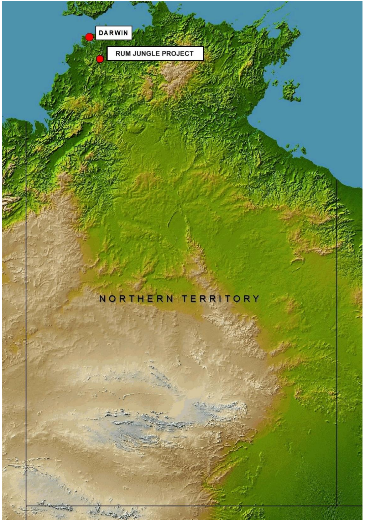
Figure 2 Location of Rum Jungle Project