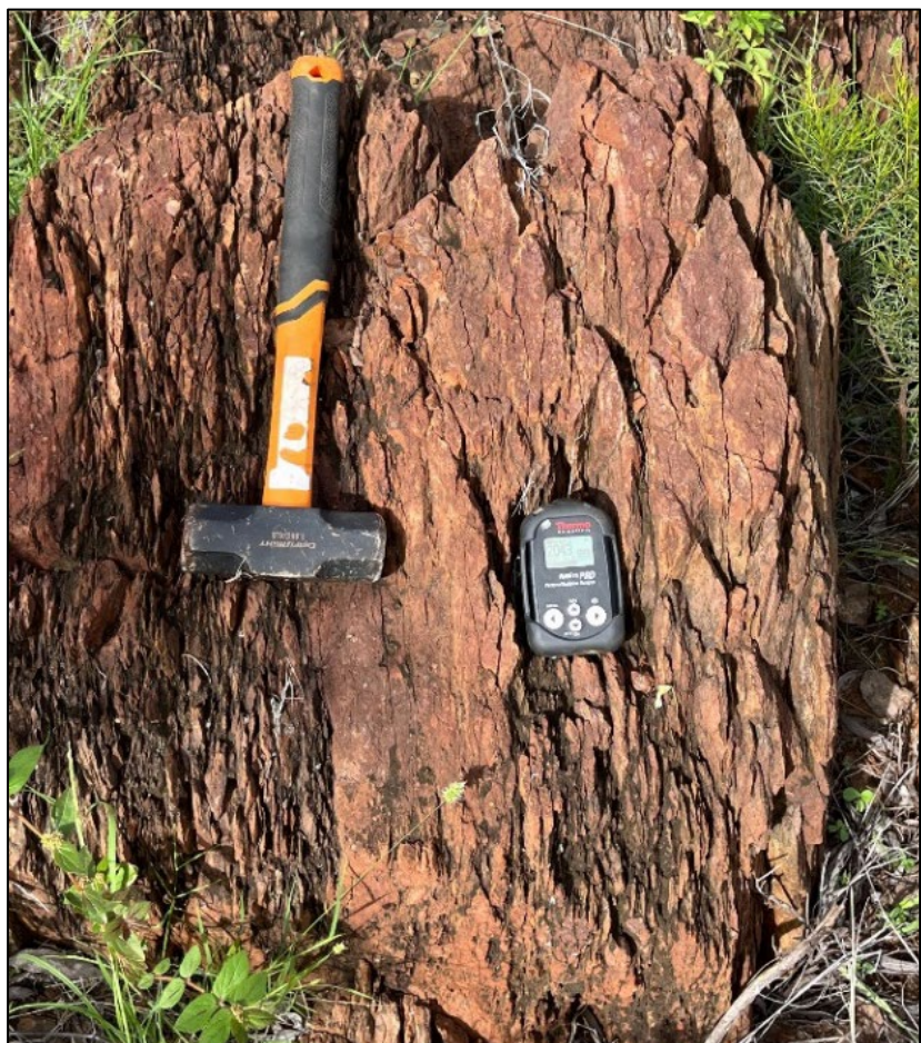
Figure 2. ASR0023 – outcrop showing sheared hematite and albitite altered basalt with RadEye scintillometer.

While in the field, the geologist also noted that several of the rock samples collected for uranium analysis had visible disseminated copper mineralisation in the form of chalcopyrite. Copper and uranium are known to exist together in separate phases in the Mt Isa area, but the amount of visible chalcopyrite was surprising, and the Company eagerly awaits the return of assays for these samples. (Assay results expected in 4-6 weeks)