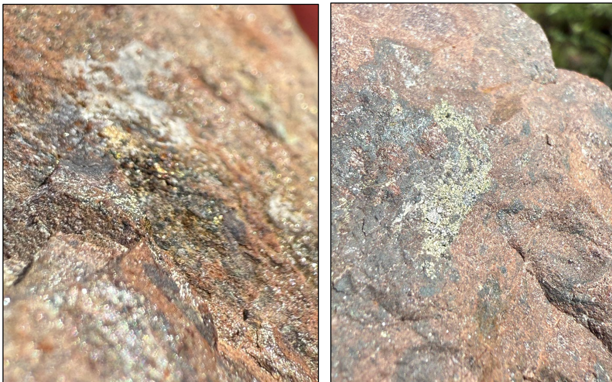
Figure 3 (Left and right): Example of the disseminated chalcopyrite mineralisation identified in rock samples collected for uranium testing at the Queens Gift Uranium prospect.

Visual estimates of mineral abundance should never be considered a proxy or substitute for laboratory analyses where concentrations or grades are the factor of principal economic interest. Visual estimates also potentially provide no information regarding impurities or deleterious physical properties relevant to valuations.