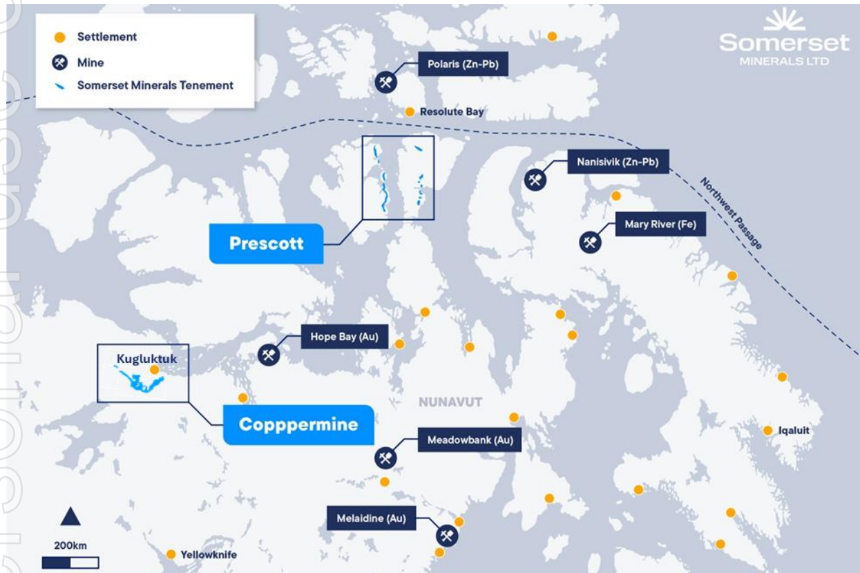
Figure 2. Overview Somerset project locations and mines in Nunavut.

The Coppermine Project is located in the Kitikmeot region of Nunavut and consists of 102 exploration licences and one exclusive exploration right executed with Nunavut Tunngavik Incorporated (NTI), covering 1,665km 2 , serving to position Somerset as the largest landholder in the Coppermine region. Importantly, over 90% of the Company's tenure comprises the Copper Creek Formation basalts, which hosts high-grade copper mineralisation.