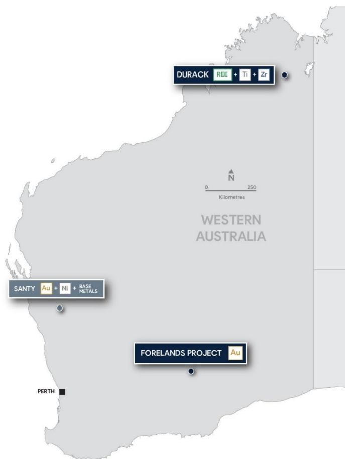
Fig. 2 - BPM Minerals Western Australian Projects

The management and exploration teams are well supported by an experienced Board of Directors who have a strong record of funding and undertaking exploration activities which have resulted in the discovery of globally significant deposits both locally and internationally.