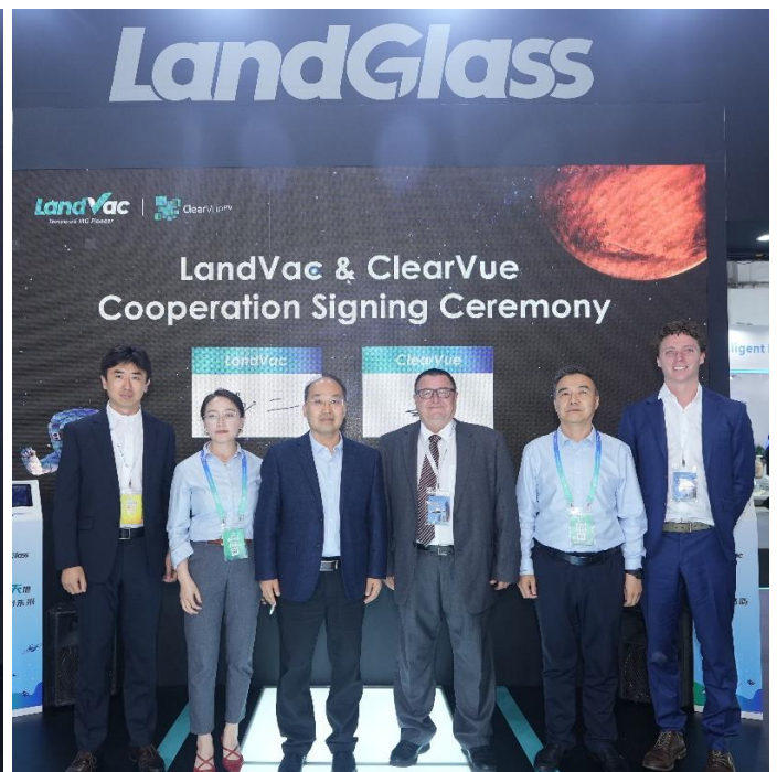
LandGlass Group & ClearVue Leadership