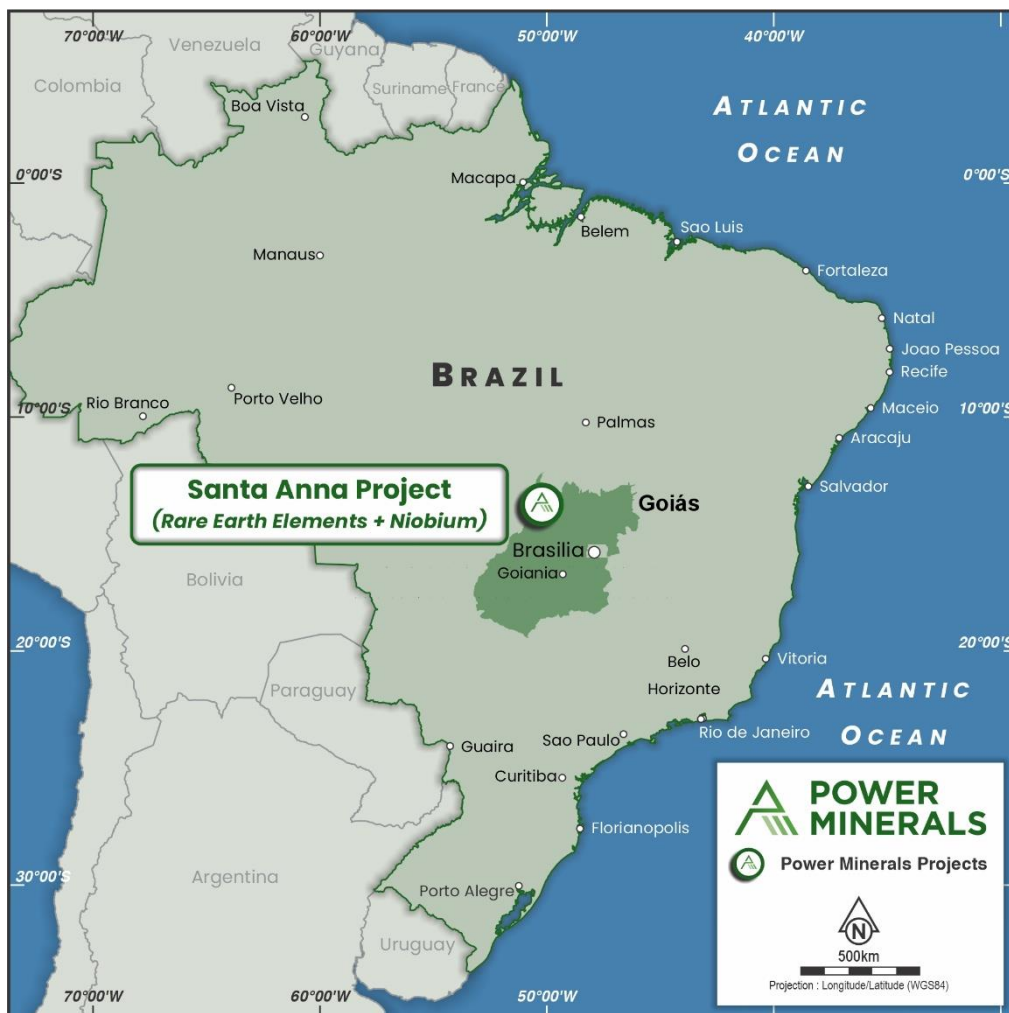
Figure 3. Santa Anna Project location map in Goiás State, central Brazil.