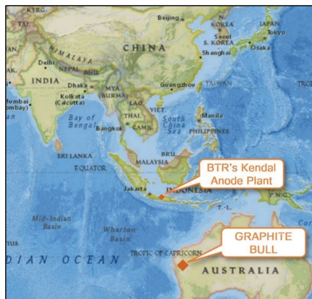
Figure 3: Graphite Bull is ideally located to supply new anode facilities in Asia

BTR New Material Group Co., Ltd. (“BTR”) is a fully vertically integrated Chinese anode manufacturer, from upstream natural graphite mining to downstream lithium-ion battery materials including anode, cathode and new materials for lithium-ion batteries. BTR has held the top global market share for sale of anode materials for 14 years, and currently has >25% of global anode market share. The company serves major lithium-ion battery manufacturers such as Panasonic, Samsung SDI, LGES, SK on, CATL, and BYD. BTR’s new 80 ktpa anode production plant in Kendal, Centra Java (Figure 2), represents a US$750M investment and started production on August 7th 2024, becoming the first anode production plant operated by Chinese company outside China. Stage 2 (also 80 ktpa) is in construction, with production scheduled for 2026. When completed this single plant will consume ~320 ktpa of fine flake (-100um) graphite feedstock. As of the end of August 2024, BTR has operating anode production capacity of 575,000 tpa.