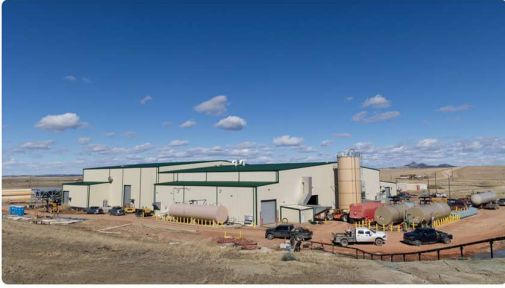
Central Processing Plant (Phase I & II)