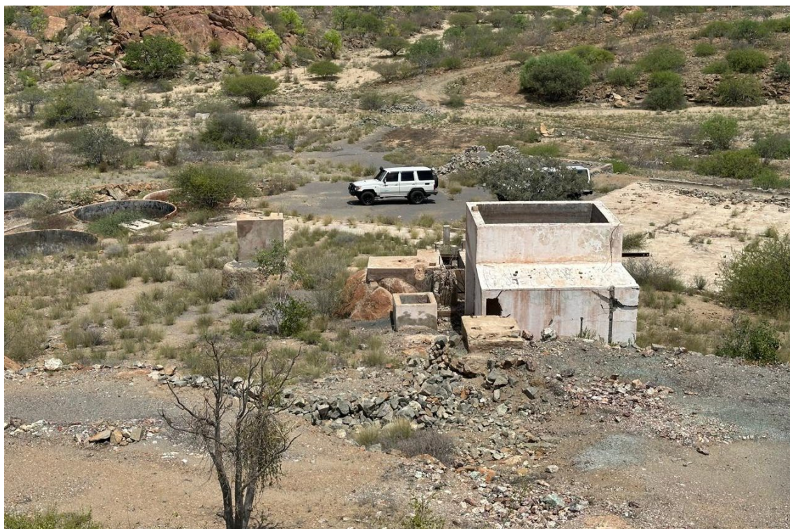
Figure 3: View westwards across remnants of the historical Maongo Ore Treatment Plant.