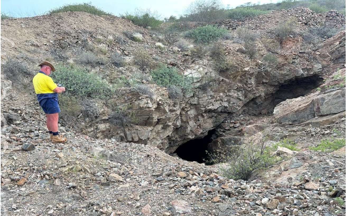
Figure 6: View southwest of historical underground mine (Maongo group) 1.9km east northeast of mine in Figures 4 and 5.