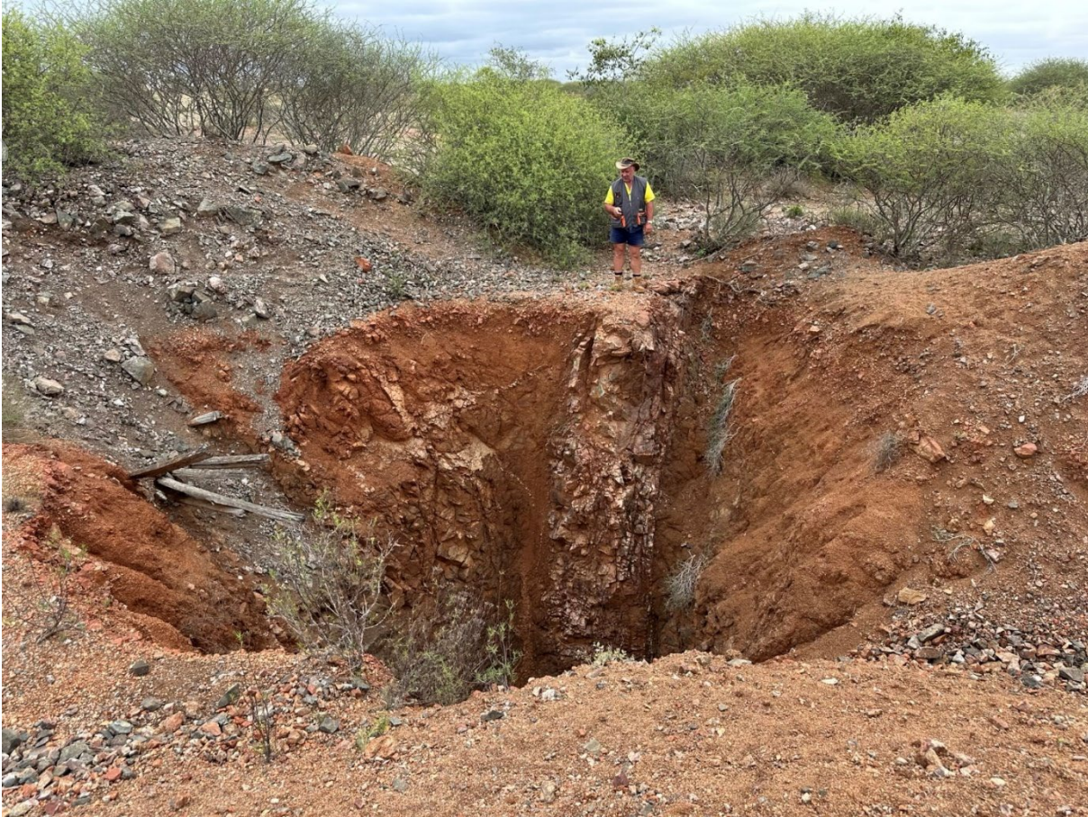
Figure 10: View west across the collapsed, main Cacimba shaft.