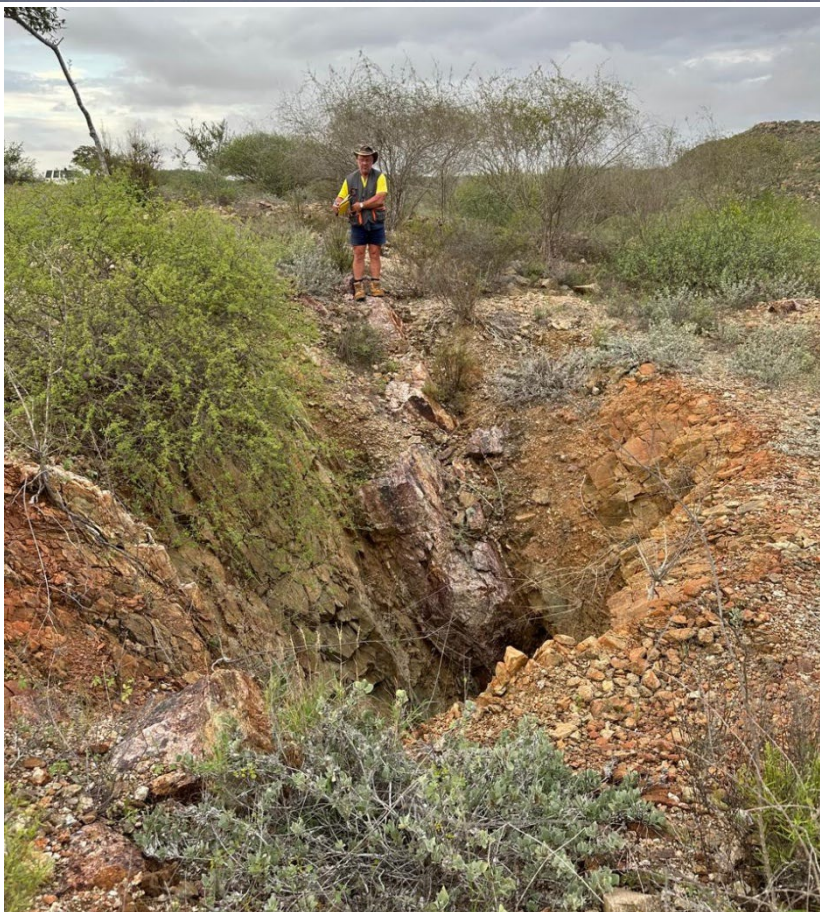
Figure 8 : View north across shaft, 200m south of mine in Figure 7 (Conango Canpungo workings).