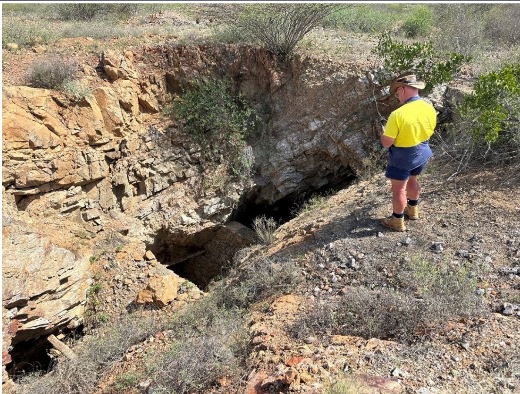
Figure 4: View south of a well-constructed historical mine; Maongo group.