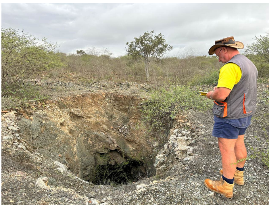
Figure 9: View east across shaft, 170m south of mine in Figure 8 (Conango Canpungo workings).