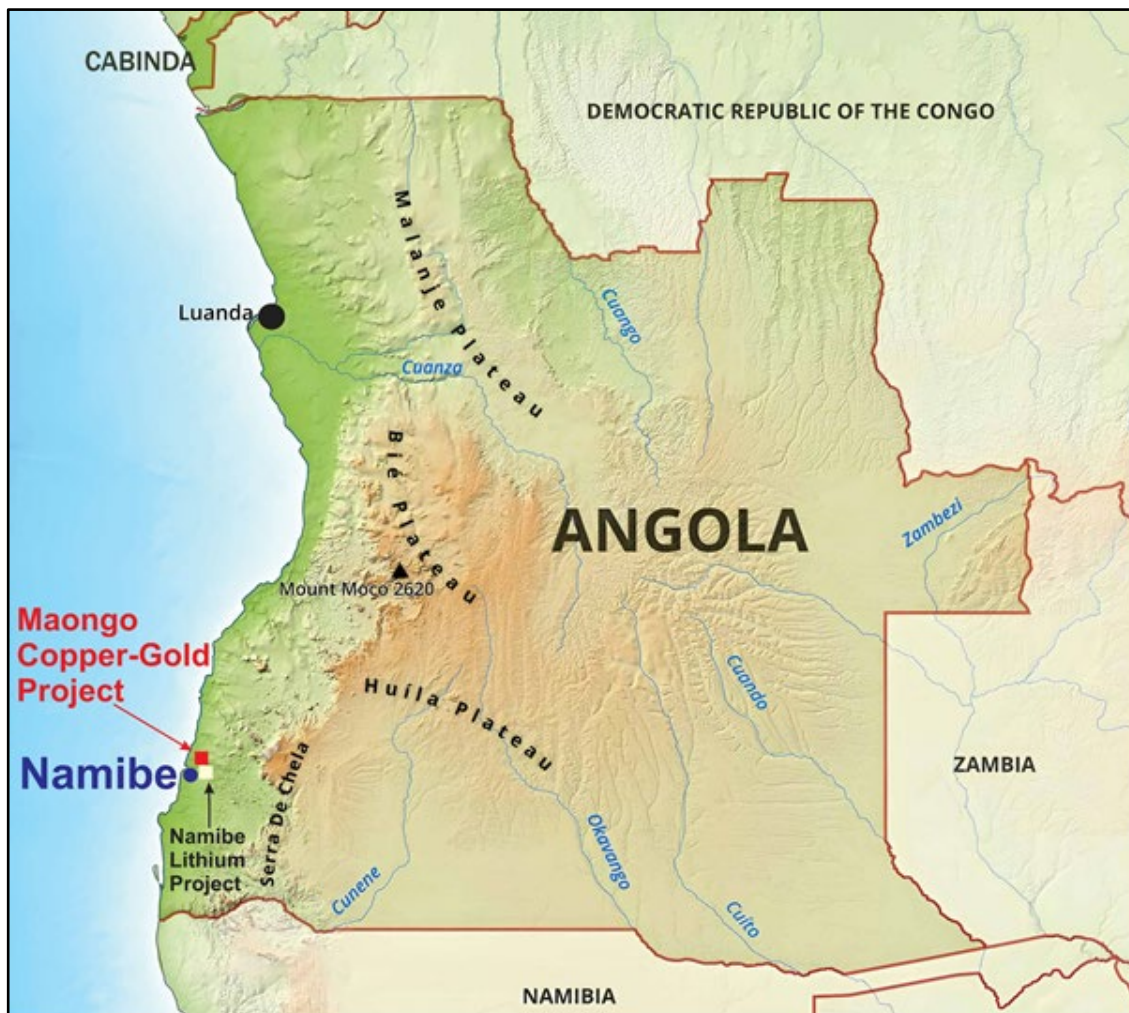
Figure 1. Location of the Maongo Copper-Gold Project, approximately 25km northeast of Namibe.

Targets generated will be drilled as they are generated.