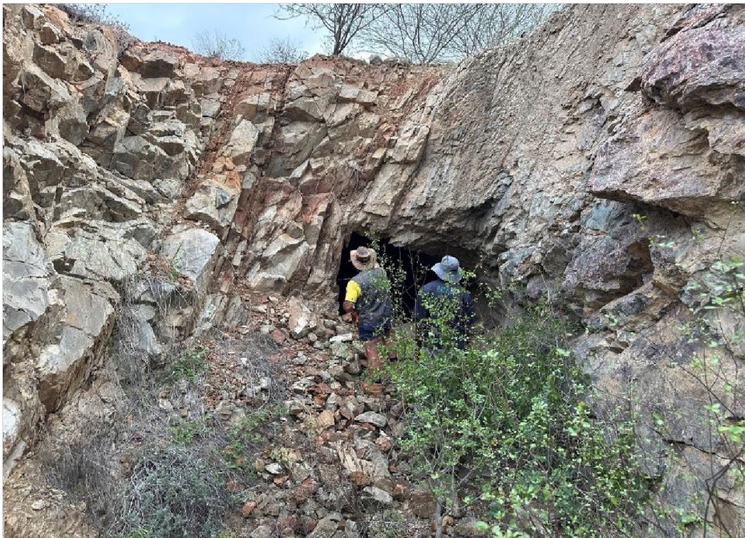
Figure 7: View south into Conango Compungo group adit at workings 800m south southeast of mine in Figure 6.