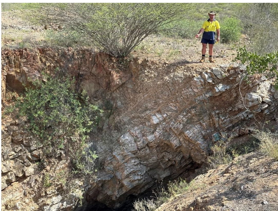
Figure 5: Detailed view of the thick laminated quartz vein in shear zone (Maongo group); see figure 4.