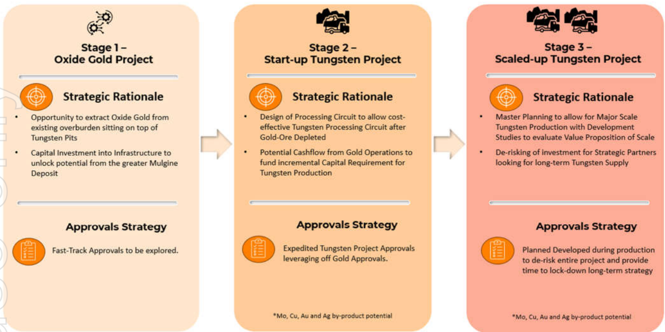
Figure 2: Development Strategy - Mulgine Trench