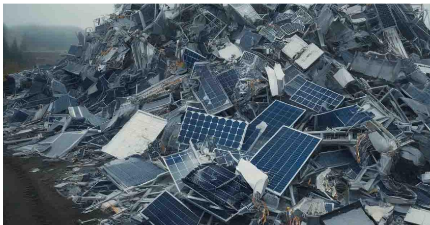
Figure 4 - Global waste from PV solar panels will reach up to 60–78 million tonnes by 2050

China is the dominant global supplier of both gallium and indium, producing around 80% of gallium and over 60% of indium. Gallium is primarily a by-product of aluminum production, while indium is extracted during zinc mining. Other notable gallium producers include Germany, Kazakhstan, and Ukraine, though their contributions are smaller. For indium, Canada and Peru are significant producers, with Japan and South Korea focusing on refining and processing. These metals are crucial for high-tech applications like semiconductors, solar panels, and electronics. However, their supply chains are concentrated in a few countries, especially China, making them vulnerable to supply disruptions.