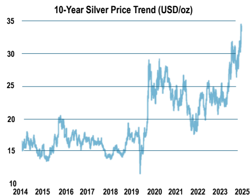
Figure 3 – Silver 10-Year Price Trend