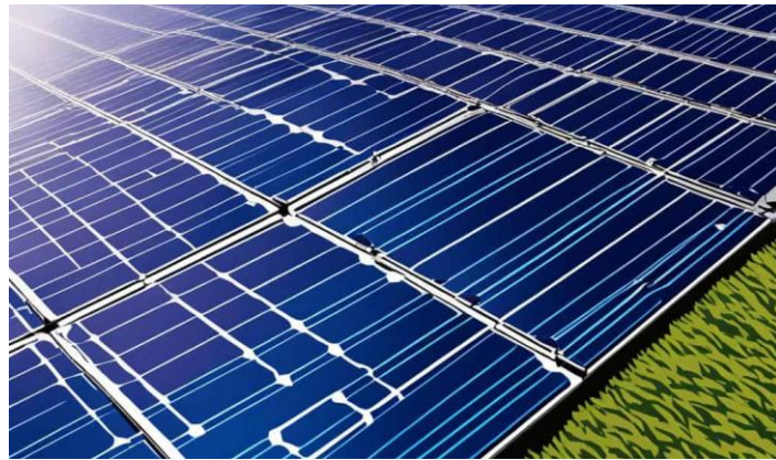
Figure 1 – Silver fingers and busbars on a solar panel transport electricity