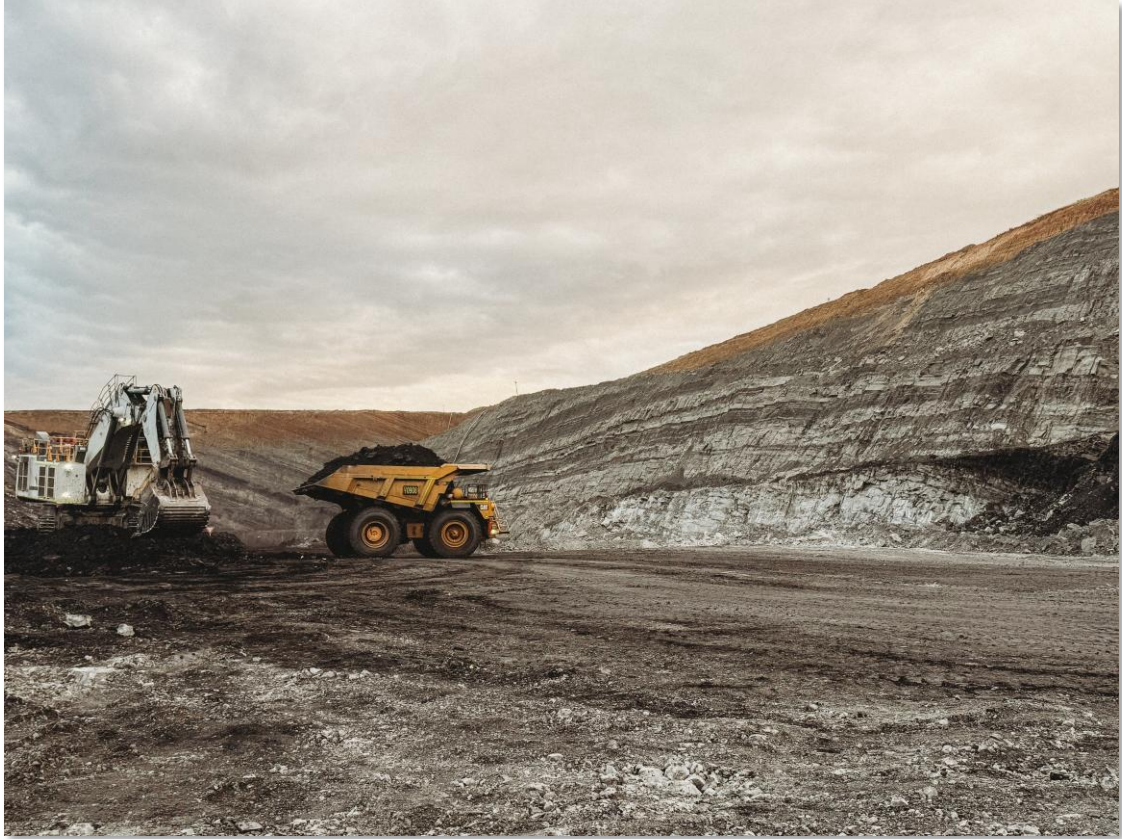
Figure 1: Commencement of owner-operator mining at the Burton Mine Complex

September 2025 quarter, or if sufficient financing initiatives being actively pursued are not achieved, operations at the Burton Mine Complex may be paused.