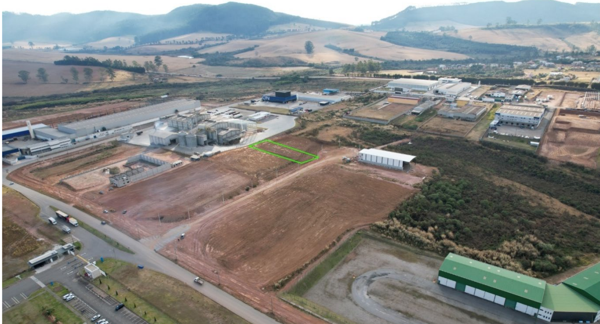
Figure 1: Aerial photograph of the Poços de Caldas Industrial Zone highlighting the Viridion site (outlined in green), surrounding industrial facilities, main access roads, and infrastructure.

The CRITR will be located in the Poços de Caldas industrial zone, nearby to the Colossus Northern Concessions resource. The CRITR will be developed on a 2,071m 2 site granted by the municipal government under Law No. 6/2025 and it will host Latin America's first demonstration-scale facility for rare earth separation and magnet recycling. This industrial zone benefits from robust municipal infrastructure, including paved access roads, reliable utility connections and proximity to key logistics corridors supporting efficient supply chain integration.