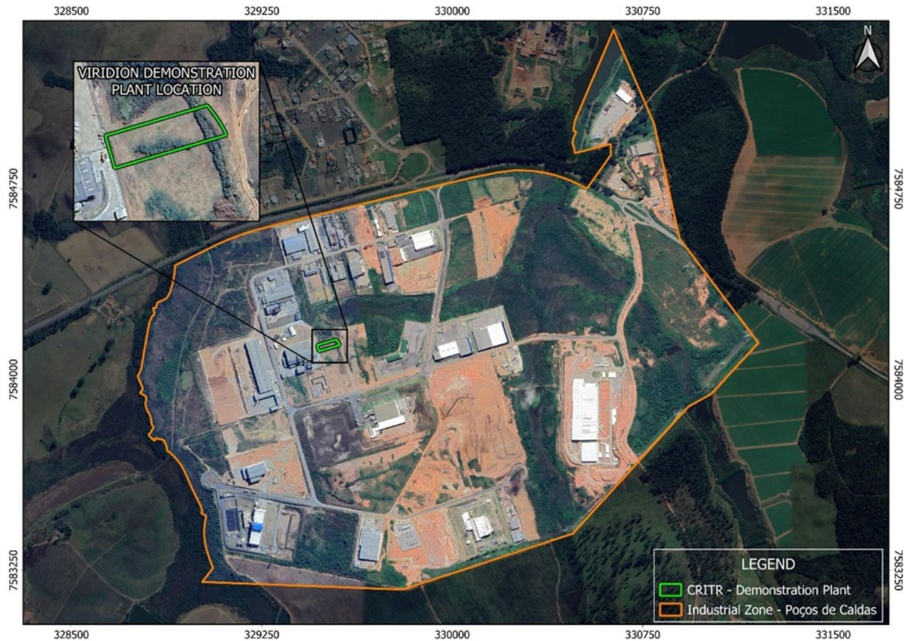
Figure 2: Satellite image of the Industrial Zone in Poços de Caldas, highlighting the area designated for developing technology centres in partnership with the private sector.

In compliance with the legal framework, Viridion is required to maintain continuous operations for a minimum of 10 years, generate 48 direct jobs across production and engineering, contribute R$100,000 (~ US$16,667) to municipal programs, and provide annual compliance reports to the Economic Development Secretariat.