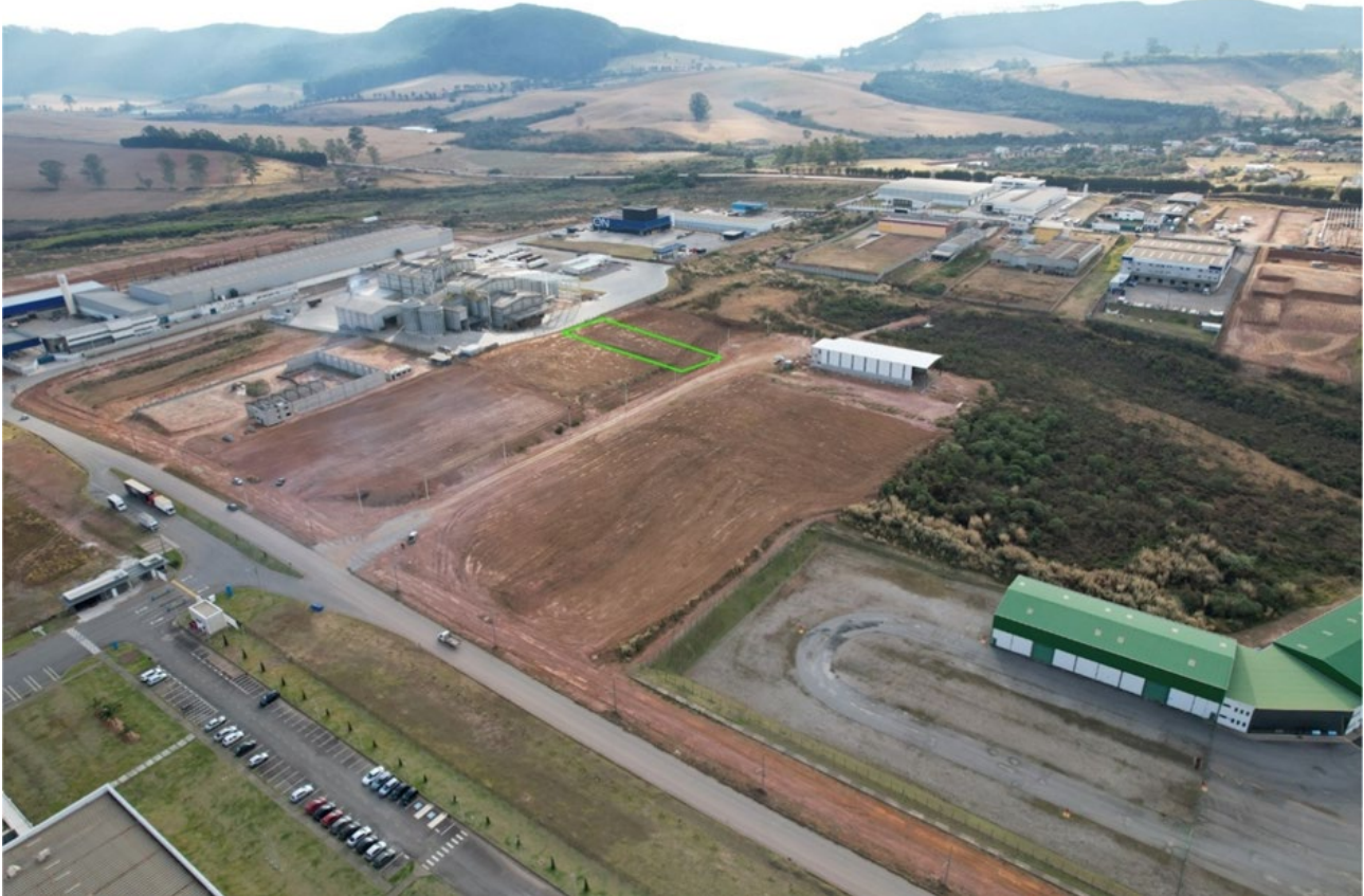
Figure 1: Aerial photograph of the Poços de Caldas Industrial Zone highlighting the allocated Viridion site (outlined in green), surrounding industrial facilities, and main access roads.

Viridion received unanimous approval from the Poços de Caldas City Council for the official grant of land, a definitive endorsement by the local government and Mayor. This milestone reflects strong community and government support for Viridion, reinforcing its strategic upside for value addition within Brazil, the state of Minas Gerais, and the local Poços de Caldas economy.