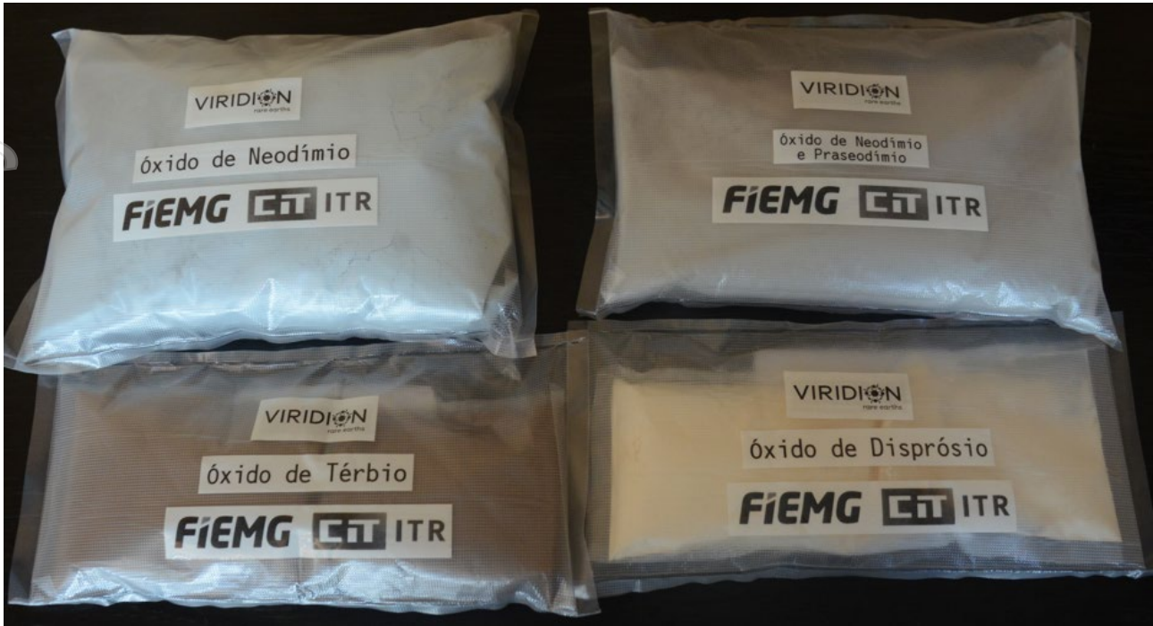
Figure 3: Recycled high-purity Nd, Pr, Dy, Tb oxides delivered to CIT SENAI ITR / FIEMG in May 2025, originating from end-of-life magnets recovered in Brazil and processed at Ionic Technologies' facility in Belfast, UK.