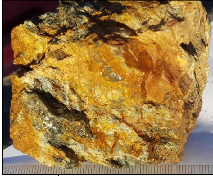
Image 3: El Dorado Magnetite samples grading 34.6% Fe (ED12250525)