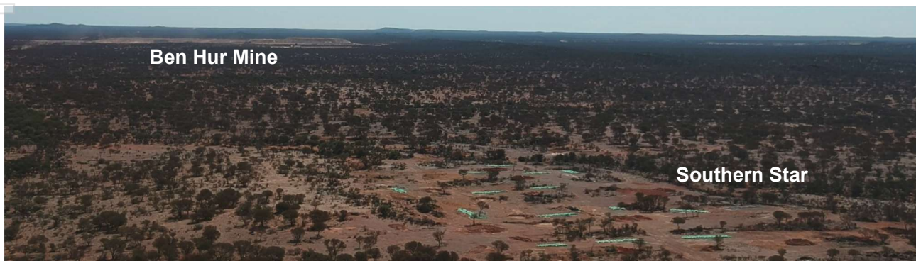
Figure 1. Photograph looking north with Southern Star drill pads in the foreground and Ben Hur mining operations in the distance.