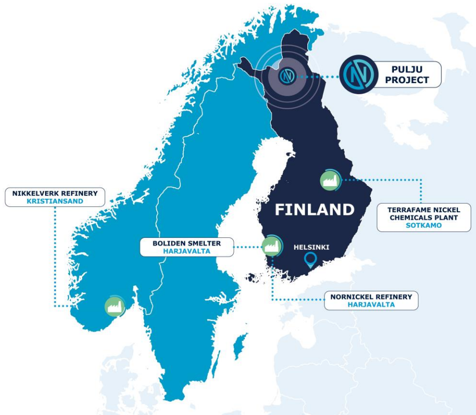
Figure 3. Location of Pulju Nickel Project and Western Europe’s entire nickel sulphide smelting and refining capacity.

Following the conclusion of the 2023 drilling campaign, in March 2024, Nordic Nickel reported an updated in situ Mineral Resource Estimate for the Hotinvaara disseminated nickel sulphide deposit within the Pulju Project area which comprises 418 million tonnes grading 0.21% Ni, 0.01% Co and 53ppm Cu for 862,800 tonnes of contained Ni, 40,000t of contained Co and 22,100t of contained Cu 8 , making Hotinvaara already one of Europe’s largest undeveloped nickel-cobalt resources. Metallurgical results demonstrated that an 18% nickel concentrate with payable cobalt can be produced from the Hotinvaara mineralisation, with 62% recovery achieved in a first pass test program. 9