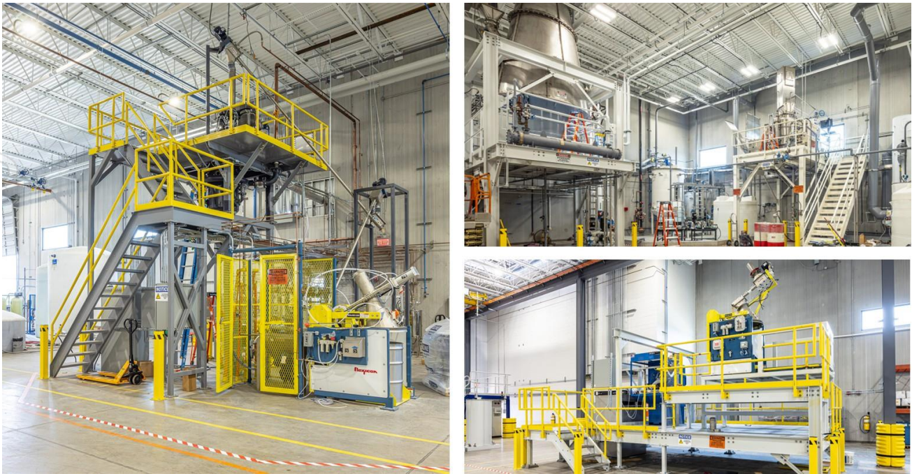
Figure 2 (clockwise from LHS): Jet mill, leaching room, scrap loading machine installed and commissioned