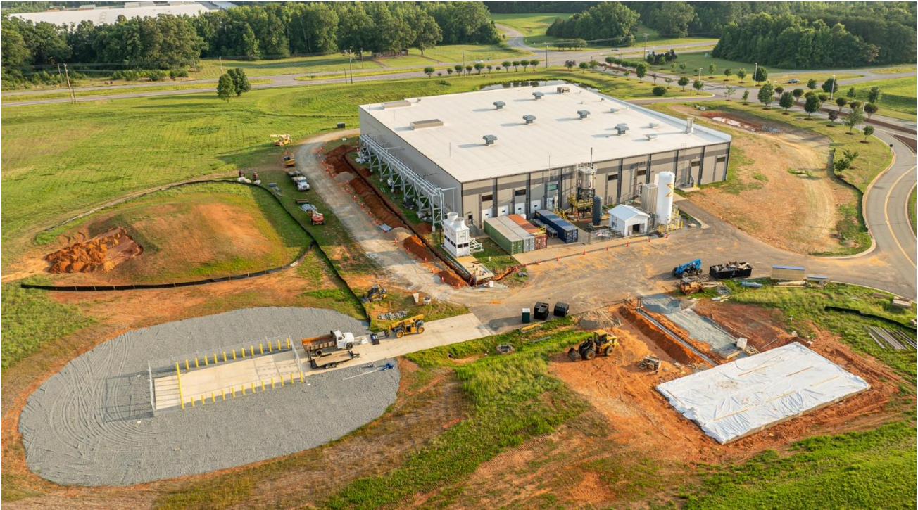
Figure 1: Titanium Production Facility ancillary facilities complete

Successful commissioning of the Titanium Manufacturing Campus in Virginia, with all major scrap-to-forged titanium manufacturing equipment now online and proven to meet operational capacity including the jet mill (scrap size reduction), HAMR furnace (deoxygenation), leaching room operations (post-deoxygenation processing) and all external ancillary facilities.