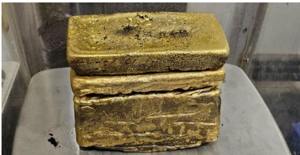
Figure 1: Paulsens weekly gold pour from late June 2025 (30,820 grams or ~990oz)