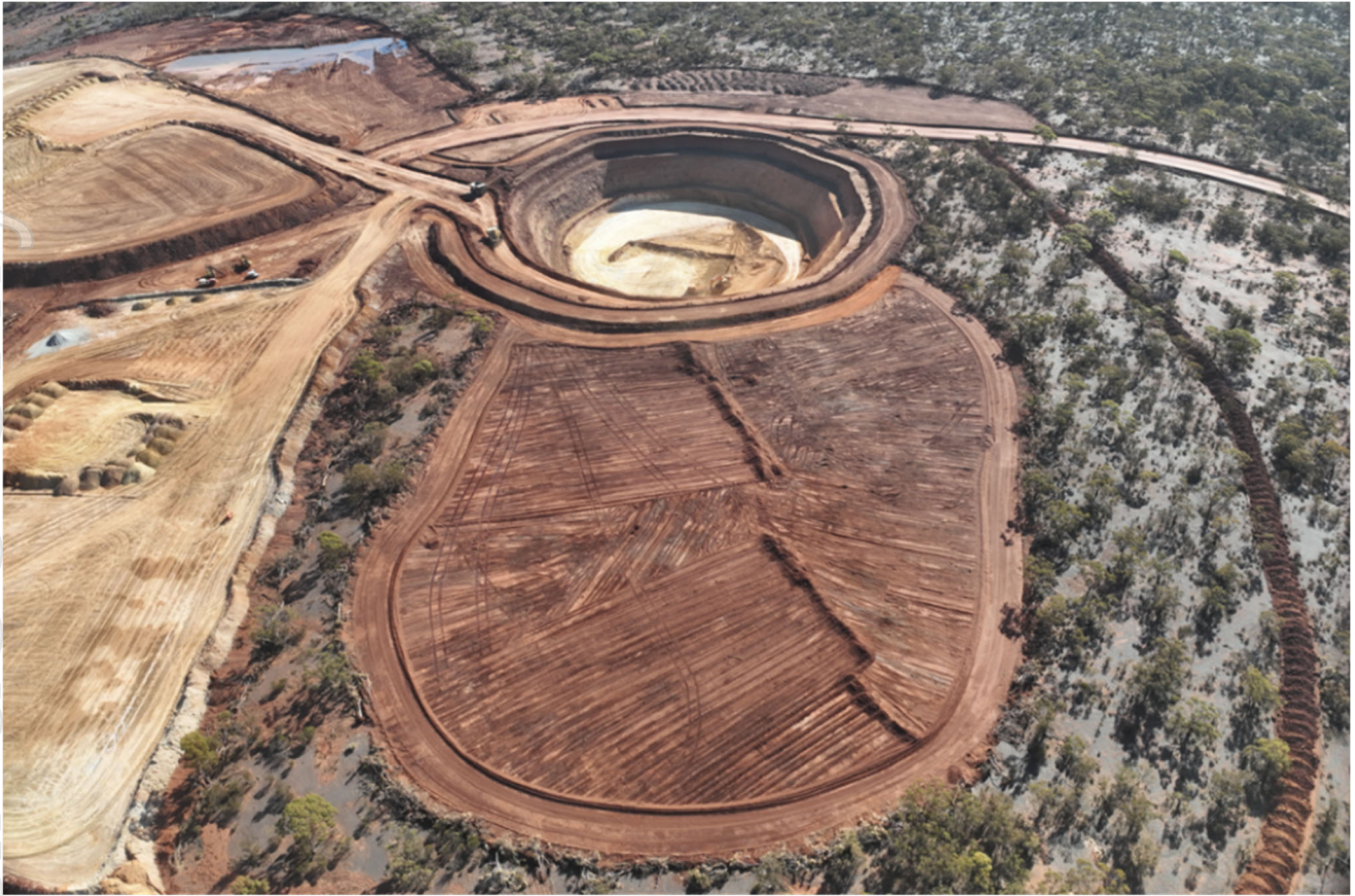
Figure 3: Boundary open pit – mining continued during the quarter