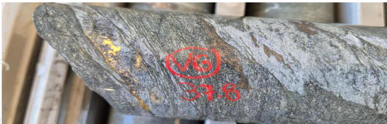
Figure 2: Core photo of visible gold from drillhole 25PGGC087 (37.8m). Trace amounts (<0.1%) of visible gold was logged within a small shear zone in the Gabbro. The shear zone was logged at being ~1m wide and the visible gold was located near the middle of the shear zone. The shear zone also contained ~5% disseminated, sheared pyrrhotite. Assays are pending for this interval and are expected in August 2025. Note: visual estimates of mineral abundance should never be considered a proxy or substitute for laboratory analyses where concentrations or grades are the factor of principal economic interest. Visual estimates also potentially provide no information regarding impurities or deleterious physical properties relevant to valuations. 13