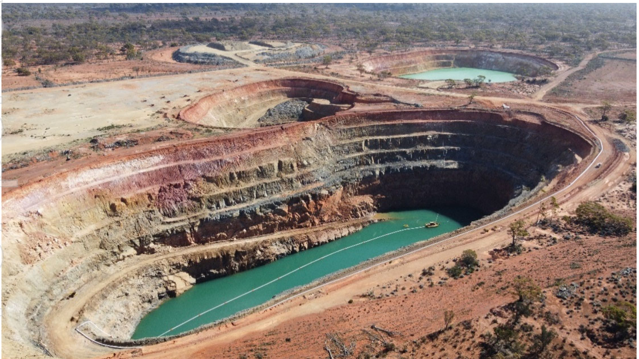
Figure 4: Majestic open pit – dewatering in preparation for a new underground mine to commence in the September 2025 quarter