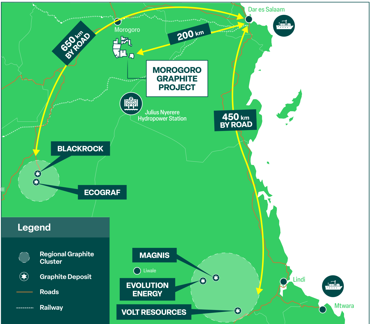
The Morogoro Project location and nearby graphite projects.

In addition, the Company’s 100% owned White Hill Project is comprised of two exploration licences in South Australia that are prospective for Rare Earth Elements.