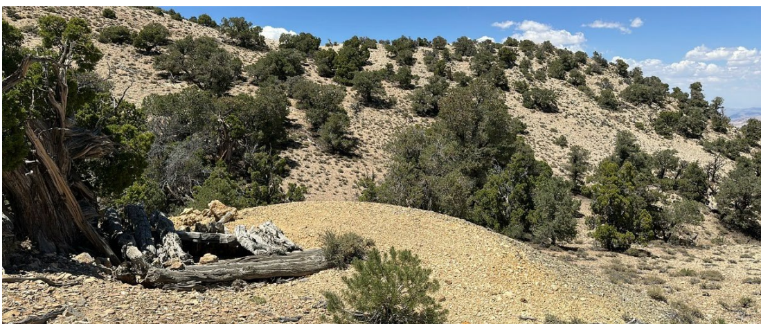
Figure 1: Historical undocumented mine shaft identified by the Staking Crew